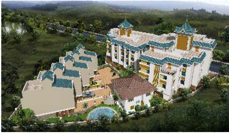
MEGHNA D.N VALLY