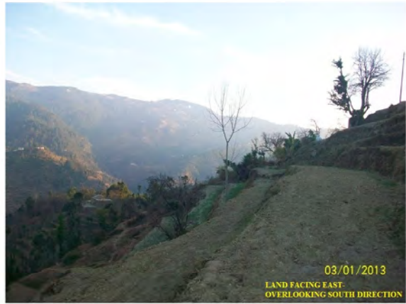
03/01/2013 LAND FACING EAST: OVERLOOKING SOUTH DIRECTION