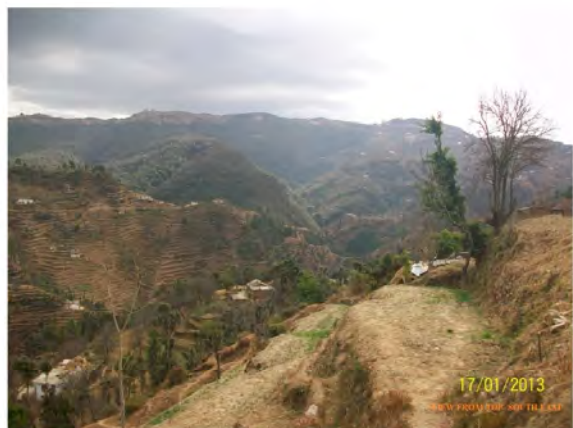
17/01/2013 VIEW FROM TOP, SOUTHWEST