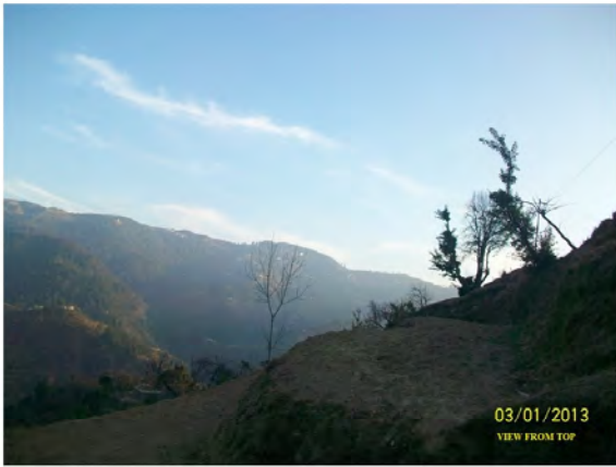
03/01/2013 VIEW FROM TOP