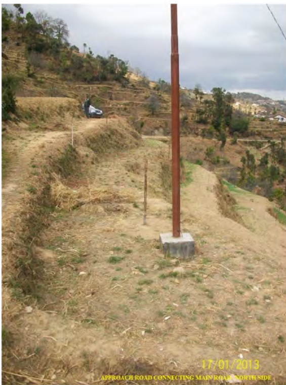
17/01/2013 APPROACH ROAD CONNECTING MAIN ROAD NORTH SIDE