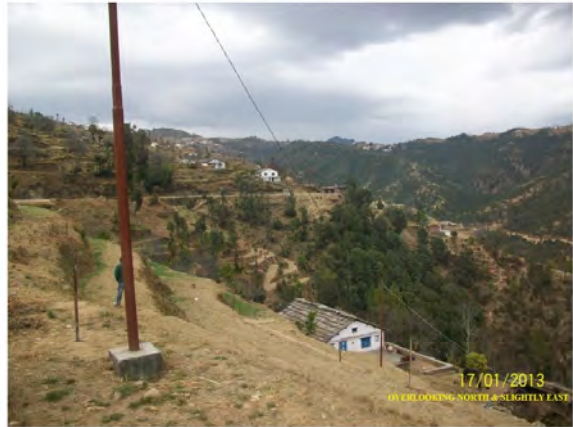
17/01/2013 OVERLOOKING NORTH & SLIGHTLY EAST