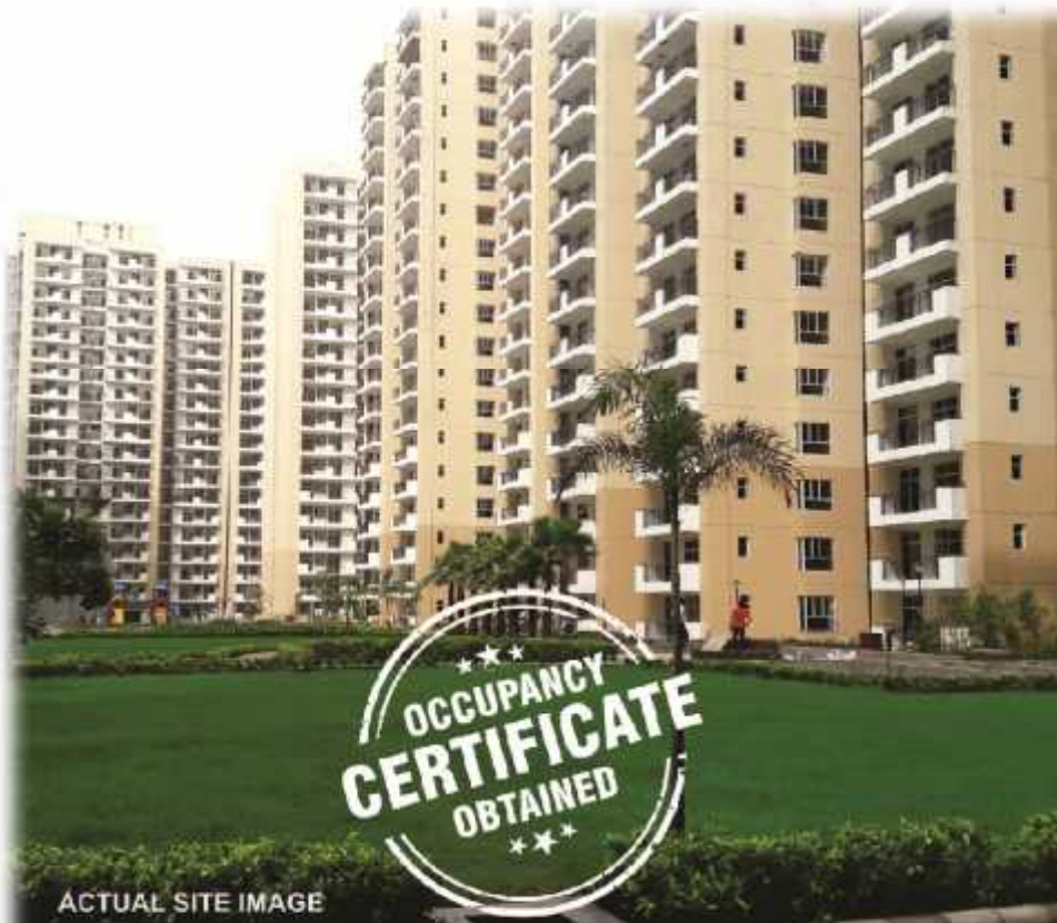
ACTUAL SITE IMAGE