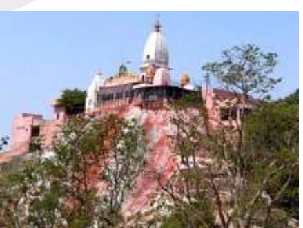
Mansa Devi Temple