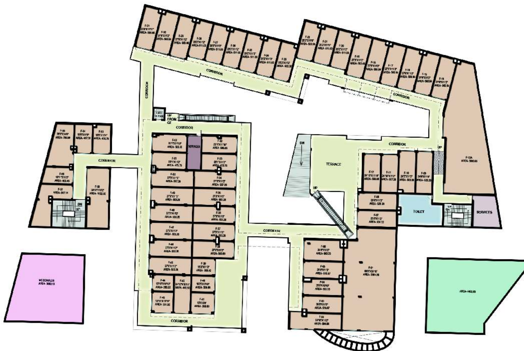
Layout Plan : First Floor