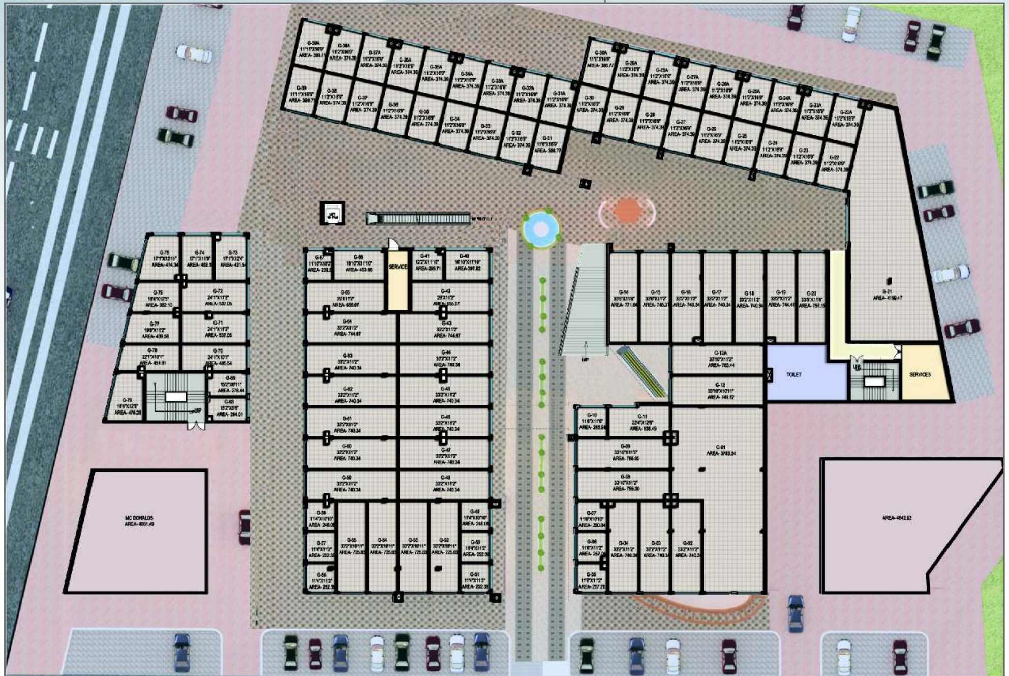
Layout Plan : Ground Floor