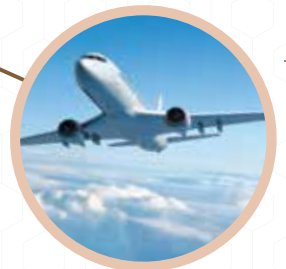
UPCOMING NAVI MUMBAI INTERNATIONAL AIRPORT 30 MINS