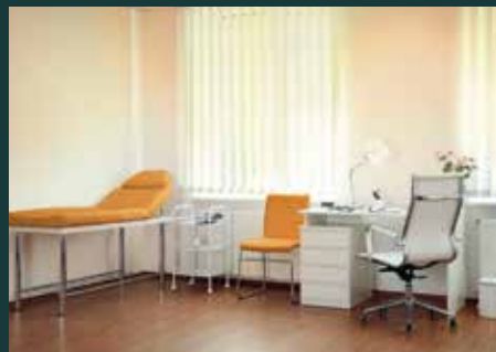
HEALTH CENTRE ^