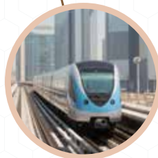
THE METRO CONNECTIVITY THANE-WADALA-BANDRA-ANDHERI 3 MINS