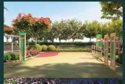
OPEN AIR GYM