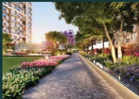
ELEVATED JOGGING TRACK