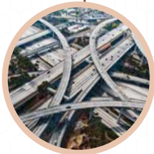
SANTACRUZ-CHEMBUR LINK ROAD 1 MIN