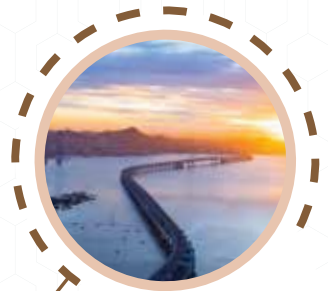
MUMBAI TRANS HARBOUR LINK 14 MINS