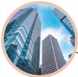
BKC CONNECTOR 8 MINS