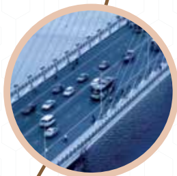
PROPOSED VIKHROLI- KOPARKHAIRANE LINK ROAD 8 MINS