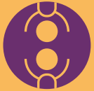
TODDLER'S PLAY GROUND