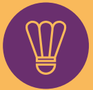
BADMINTON COURT / MULTIPURPOSE HALL