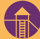
CRECHE WITH PLAY LAWN