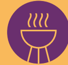
BBQ AND DINING AREA