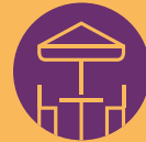
THE PIAZZA "THE SOCIAL COURTYARD"