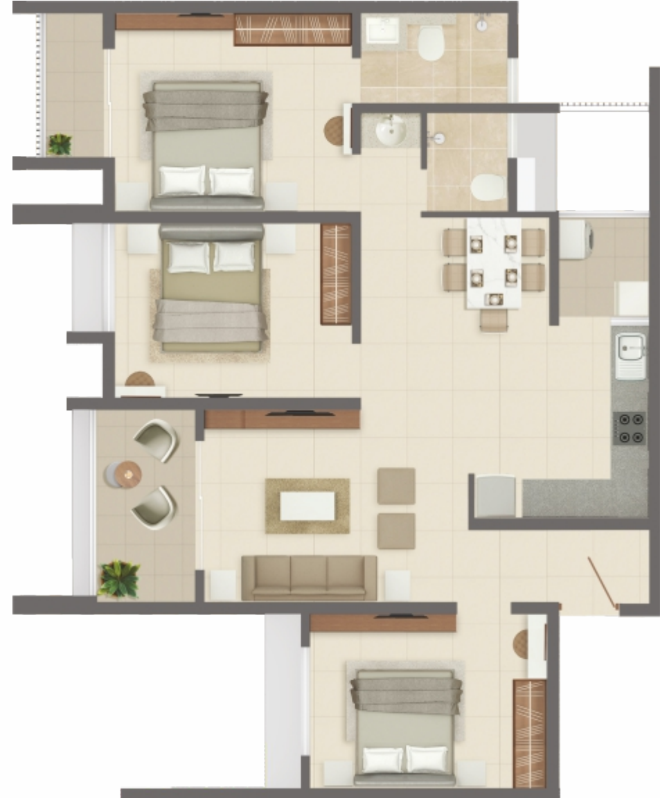
3 BHK - TYPE 1