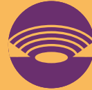
OPEN AIR AMPHITHEATRE