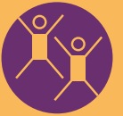
KID'S PLAY GROUND