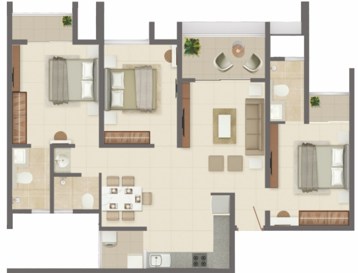
3 BHK - TYPE 2