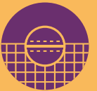
CRICKET NET PRACTICE PITCH