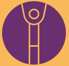
SENIOR CITIZEN OUTDOOR FITNESS