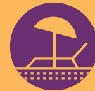
POOL SUN LOUNGE DECK