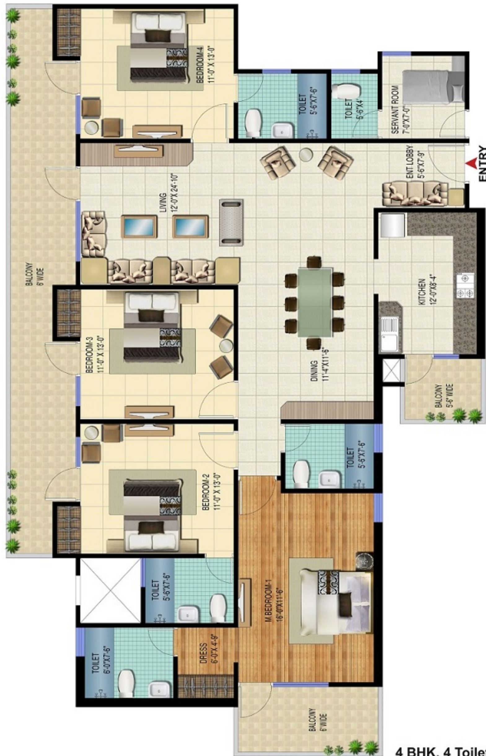
4 BHK, 4 Toilets & Servant Room