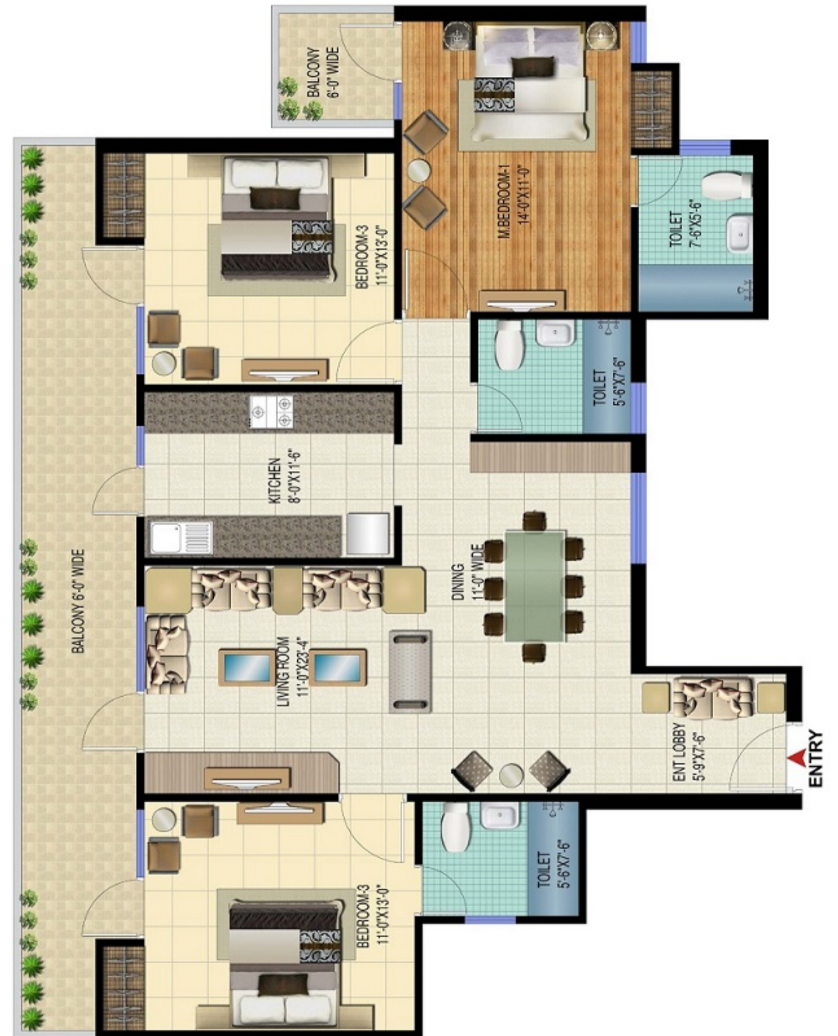
3 BHK, 3 Toilets