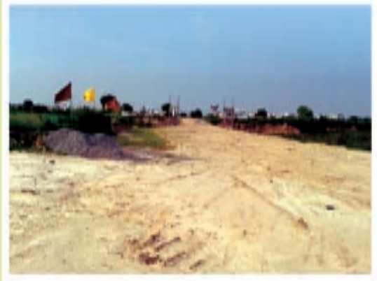
Original pictures of the Kalp City Site