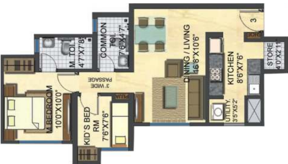
2 BHK Optima Unit Plan