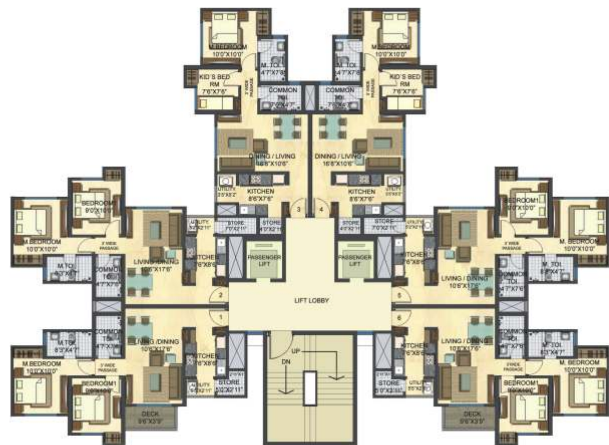
2BHK OPTIMA & ULTIMA Platina, Elitra, Sophistica