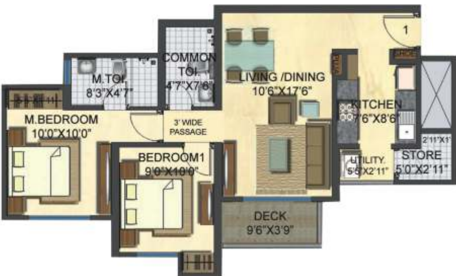
2 BHK Ultima Unit Plan