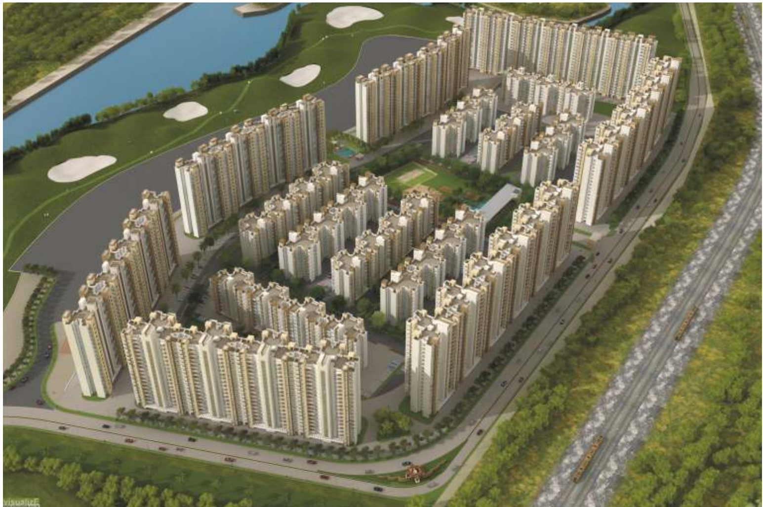
BIRD EYE VIEW