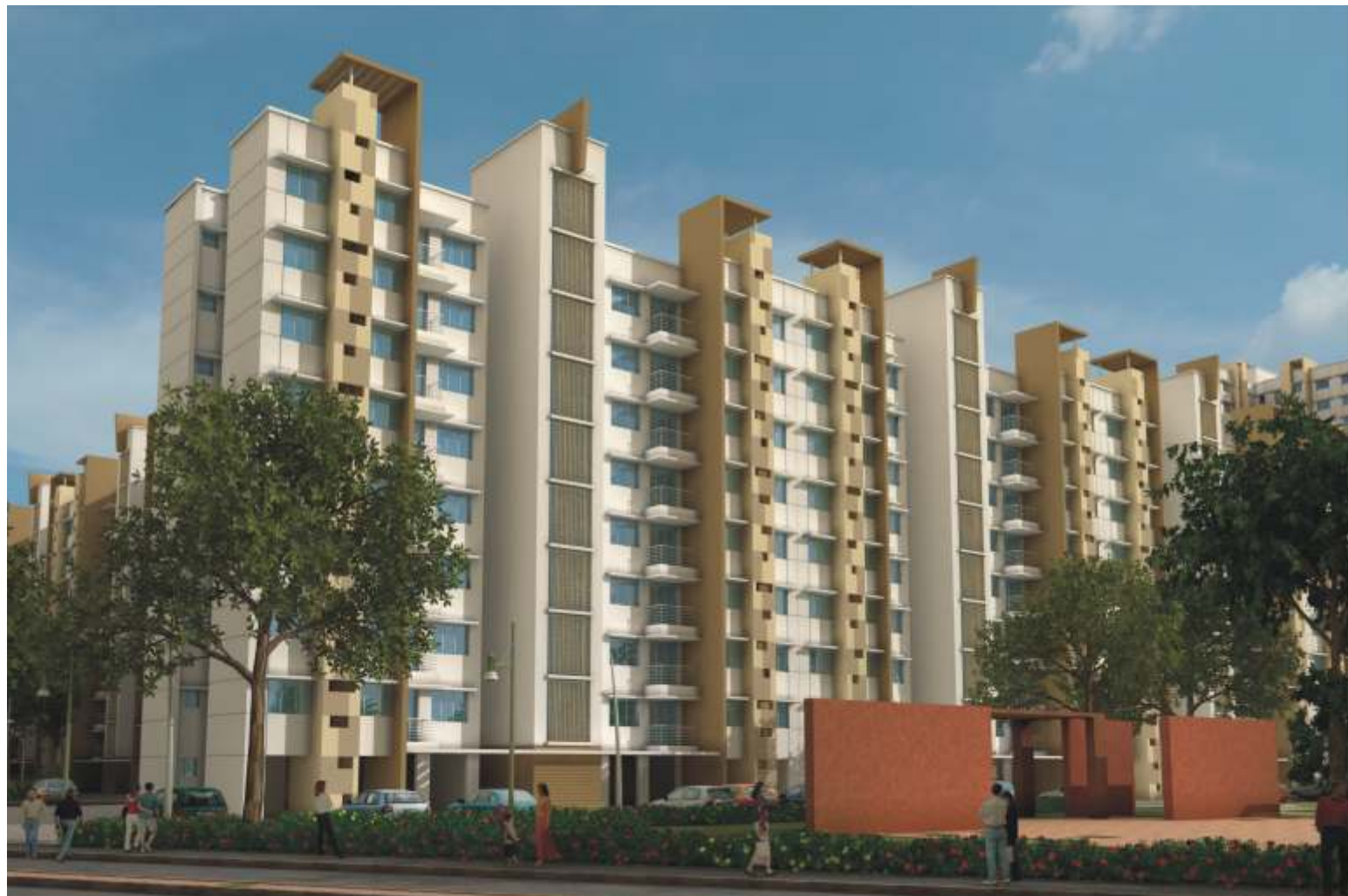
8 STOREYED BUILDING