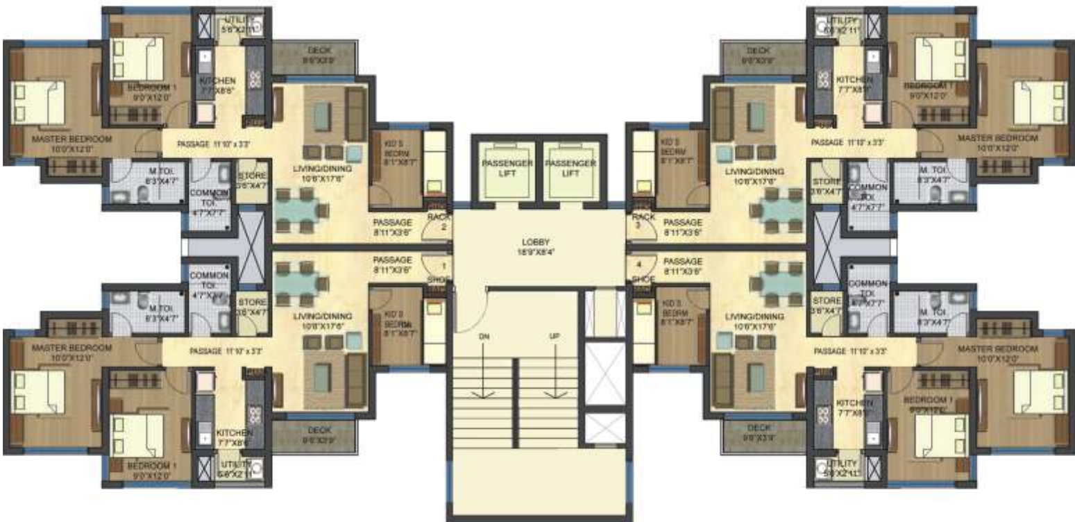
3 BHK AURA Vertica, Utopia