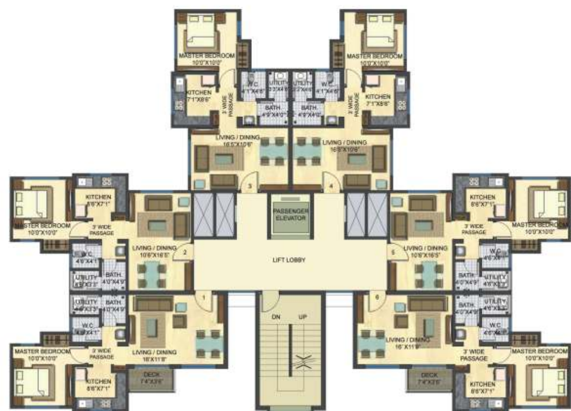
1 BHK Crestia, Primia, Spectra, Allura, Venezia, Magniferra