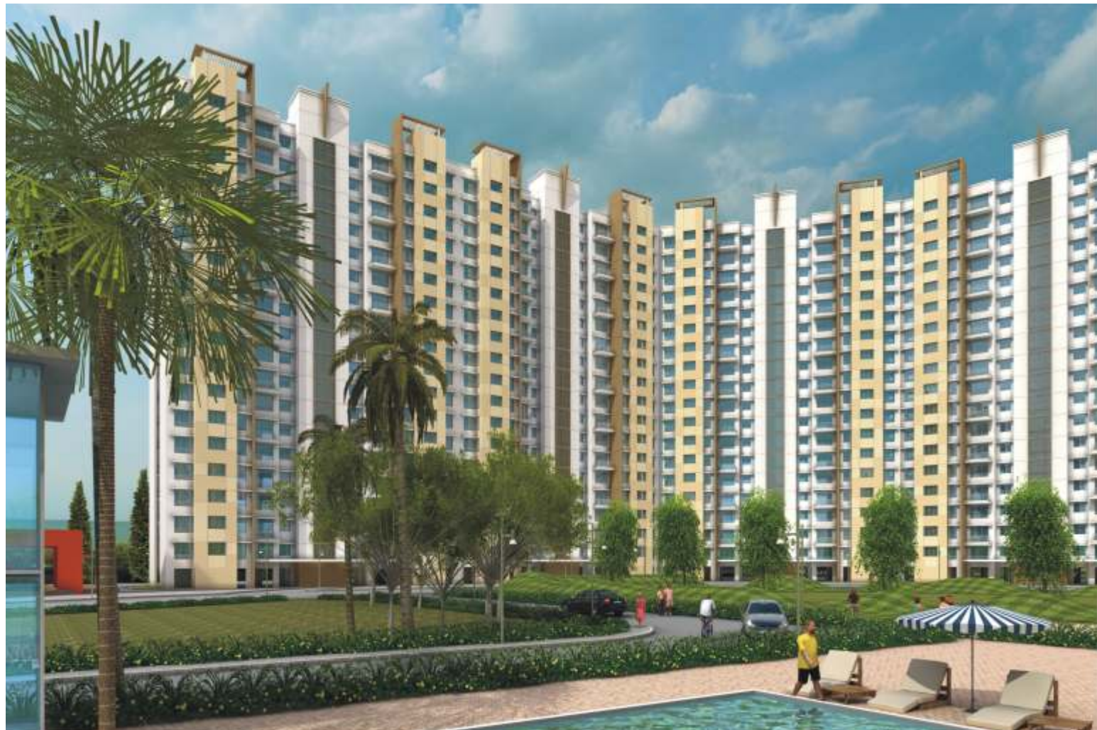
18 STOREYED BUILDING