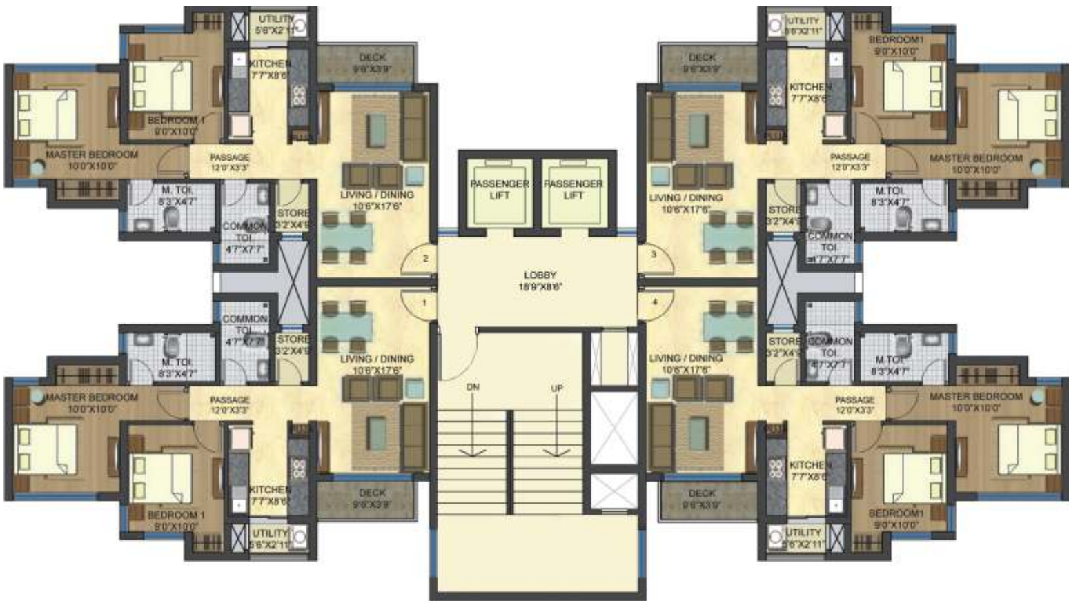
2 BHK AURA Maxima, Europa