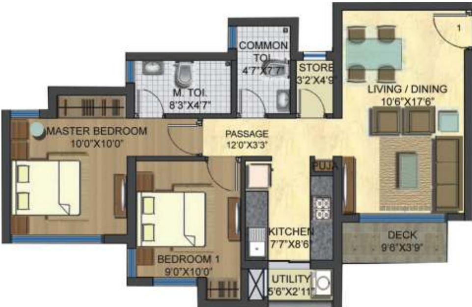
2 BHK Aura Unit Plan