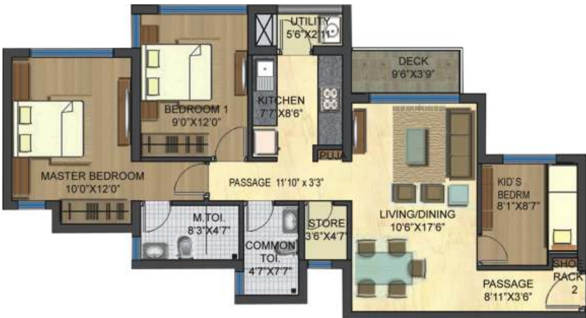
3 BHK Aura Unit Plan