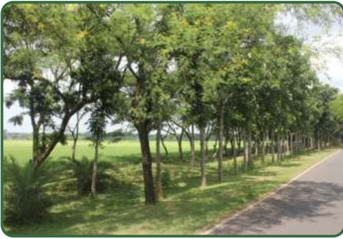
Road Side Plantation