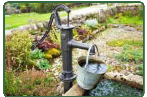
Ground Water Supply