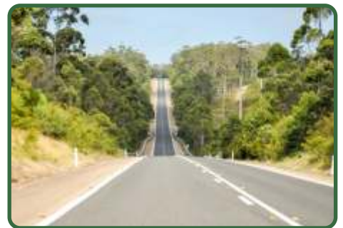
Wide Pitch Road