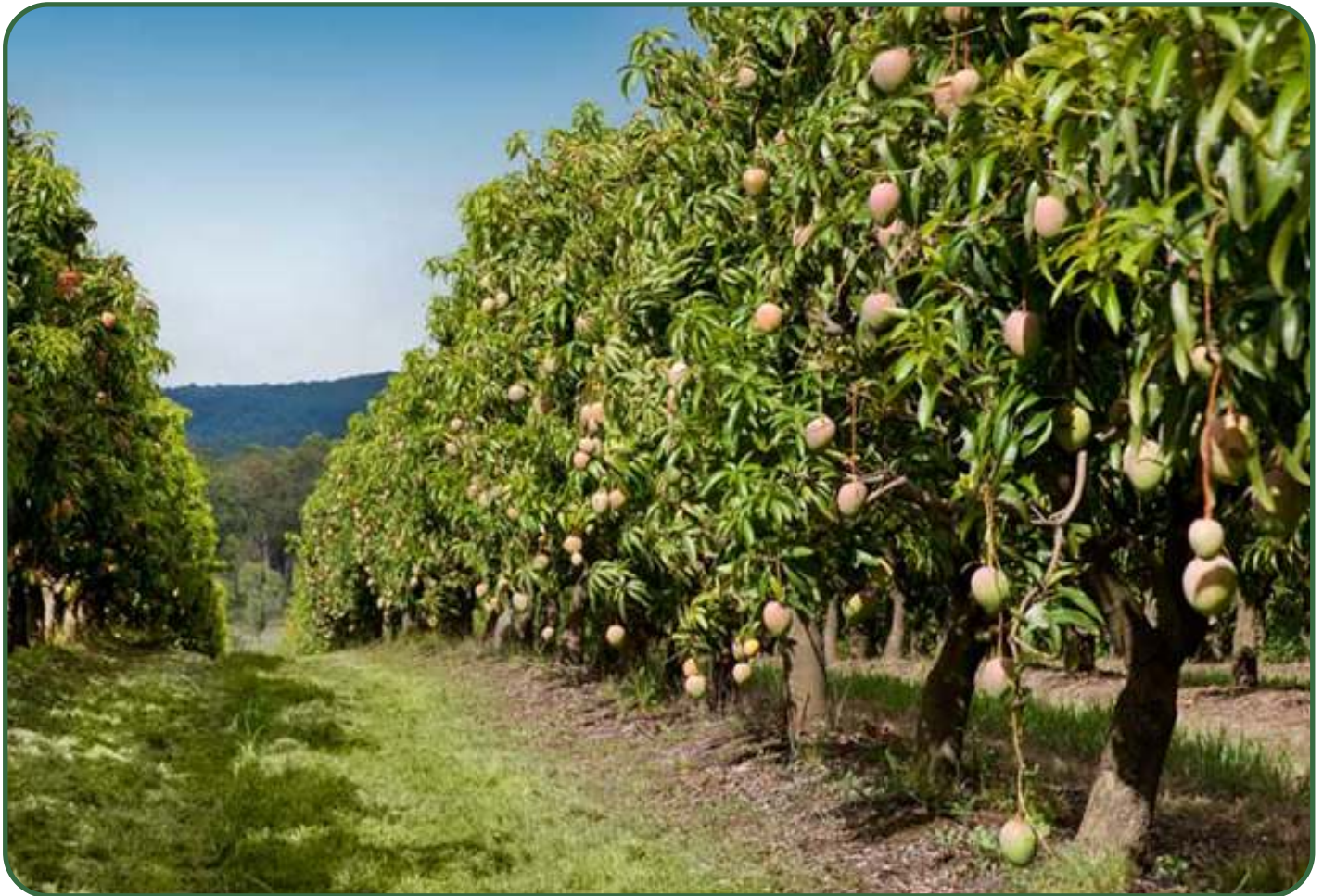
Fully Grown Trees in Fruit Orchards

Registry & Mutation Immediate Possession