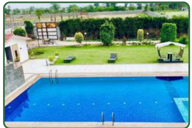
Club House with Restaurant

Buy Land, They are not making it anymore –mark twain