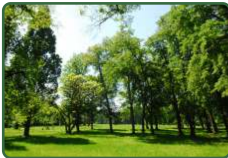
Lush Green Area