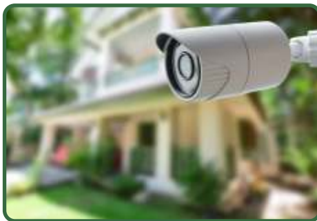
24 x 7 Security