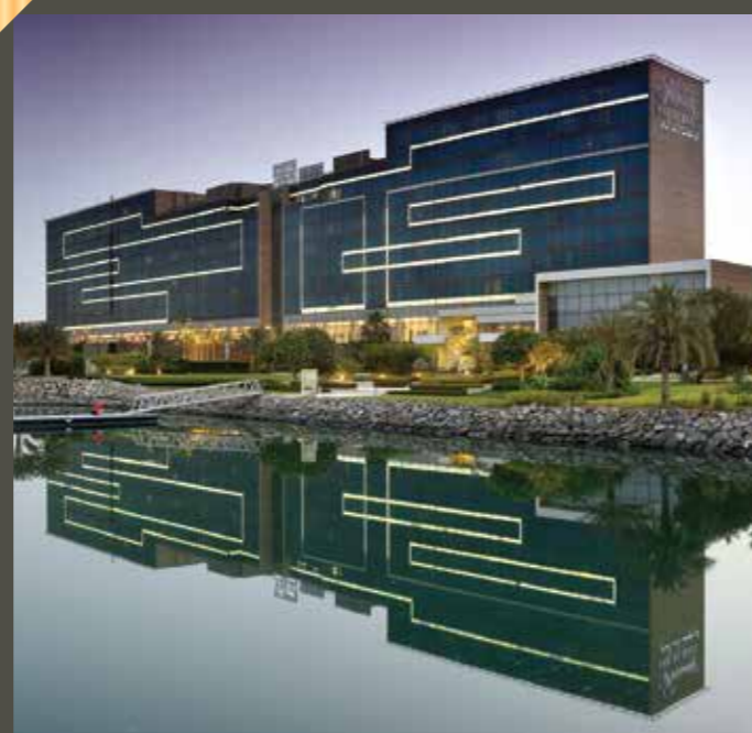
HOTEL FAIRMONT BAB AL BAHR, ABU DHABI