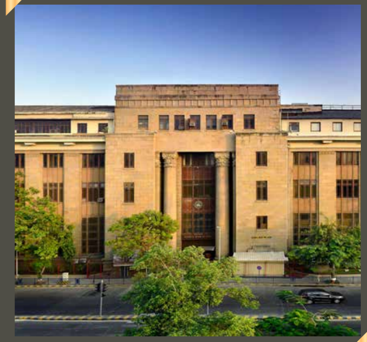
RESERVE BANK OF INDIA BUILDING, MUMBAI