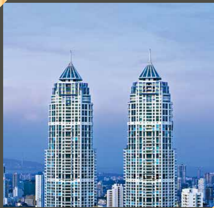
IMPERIAL TOWERS, MUMBAI