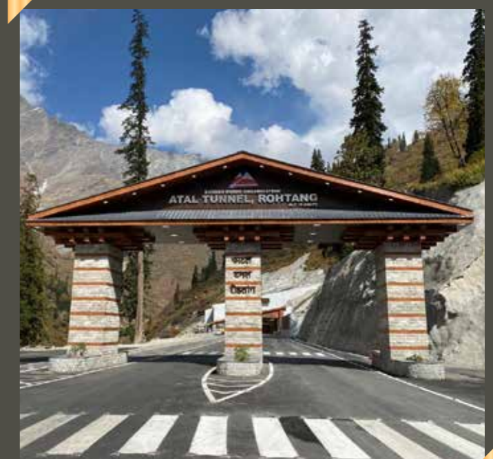
ATAL TUNNEL, ROHTANG