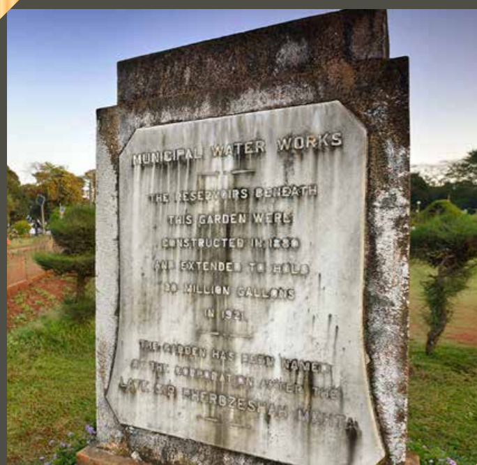
MALABAR HILL WATER RESERVOIR, MUMBAI