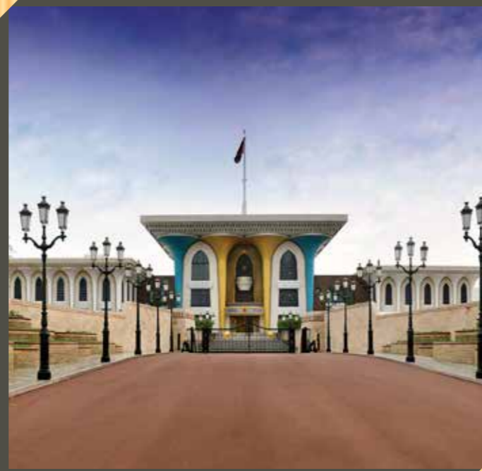
PALACE OF THE SULTAN OF OMAN