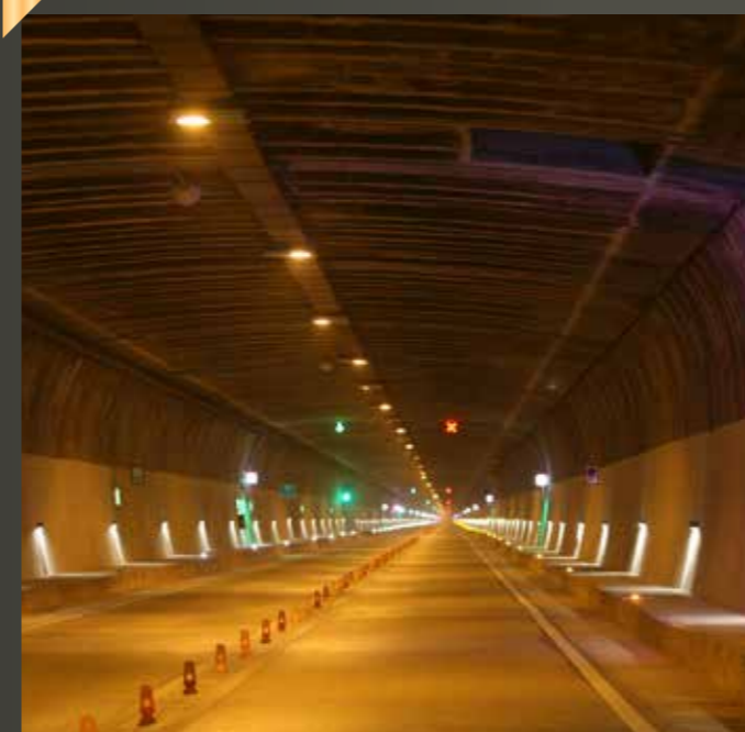
CHENANI-NASHRI TUNNEL, JAMMU & KASHMIR