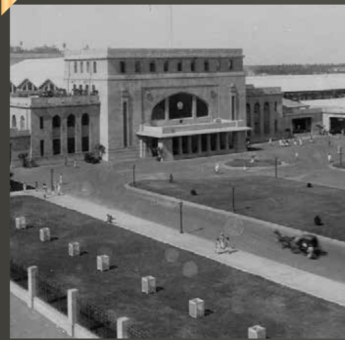
MUMBAI CENTRAL STATION MUMBAI