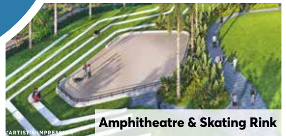
Amphitheatre & Skating Rink