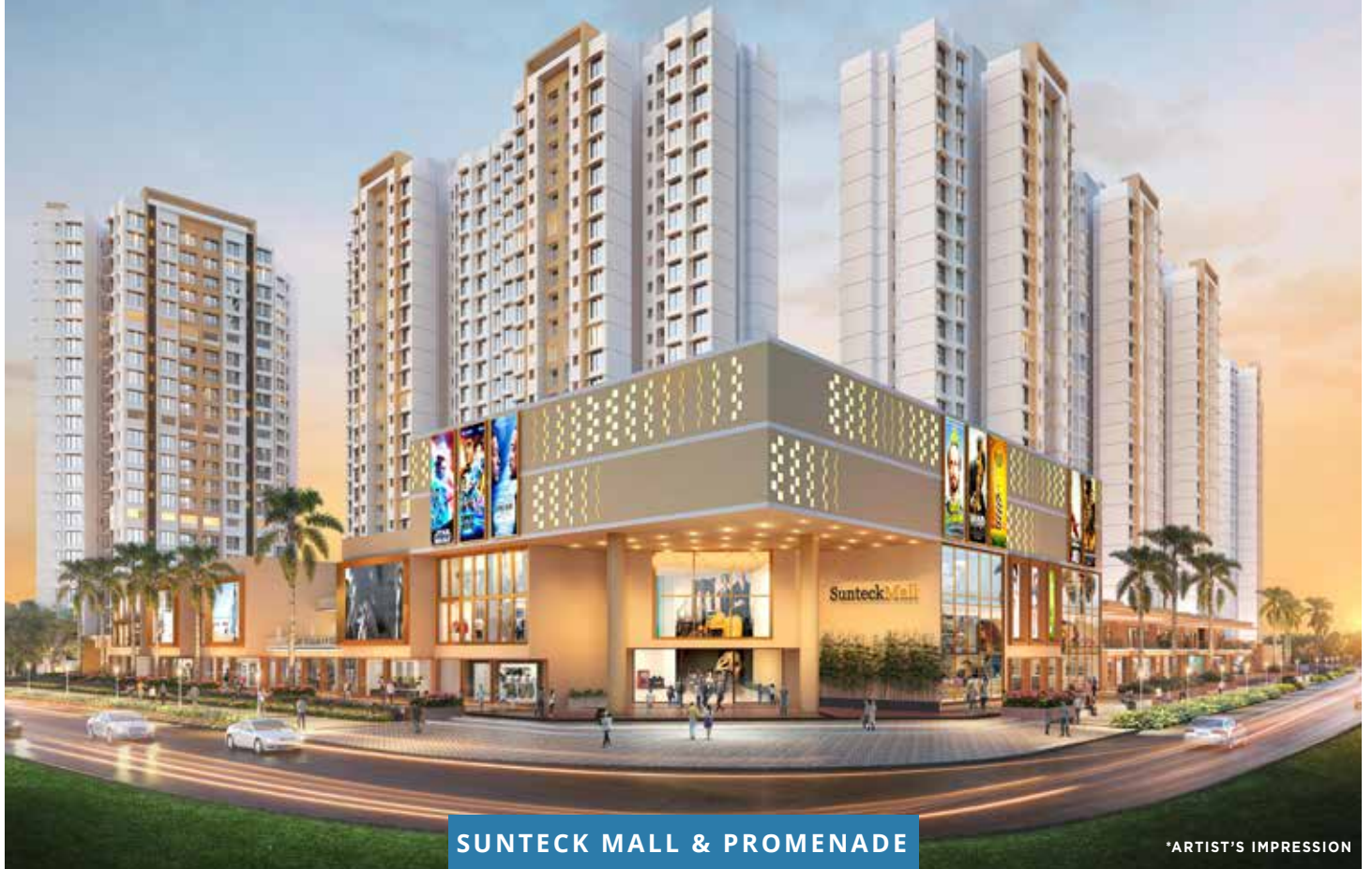
SUNTECK MALL & PROMENADE