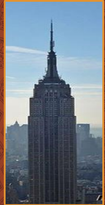
The Most Famous Structural Steel Structures in the World