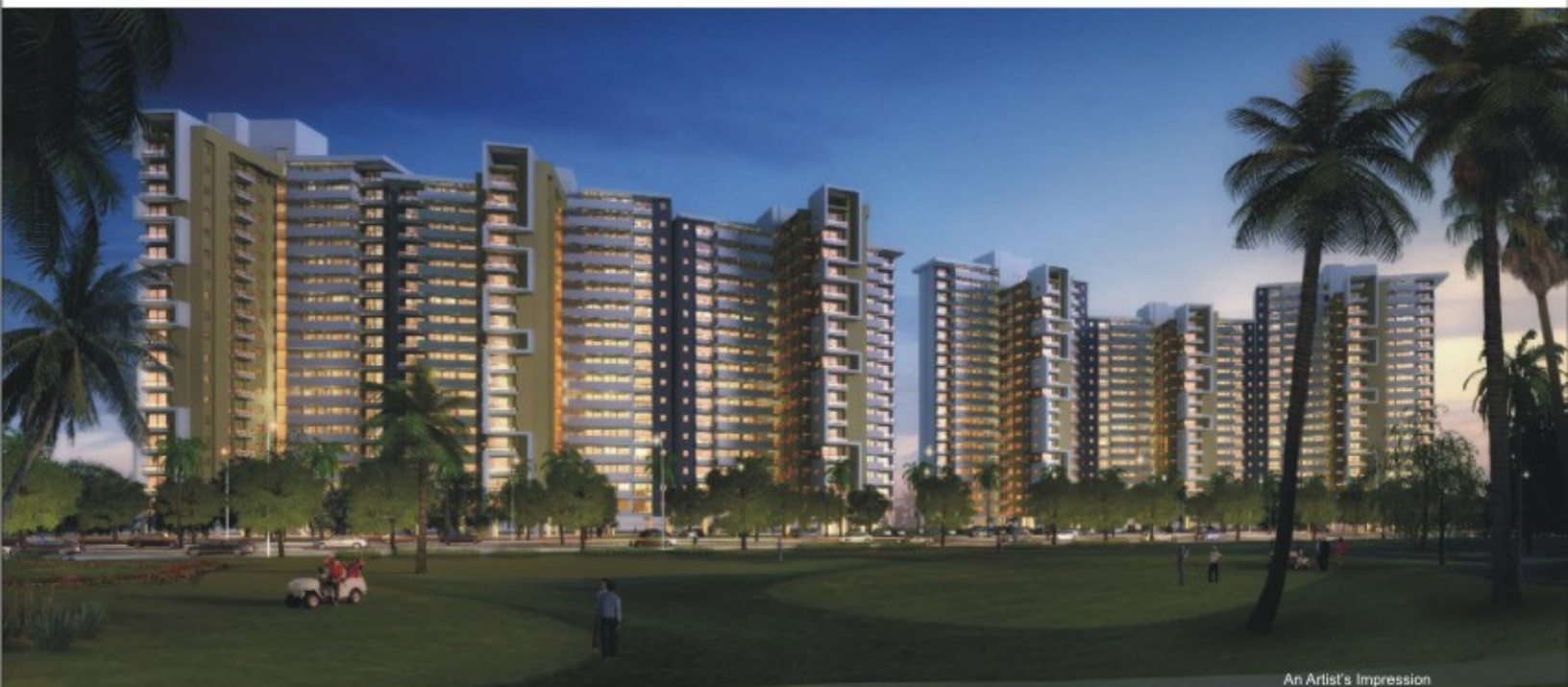
An Artist's Impression

EXPERIENCE LUXURY ATTACHED TO AN EXCLUSIVE 'GREEN' VIEW