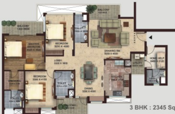
3 BHK : 2345 Sq. Ft.

Also Available: 3BHK = 2441 Sq. Ft. / 3BHK = 2381 Sq. Ft.