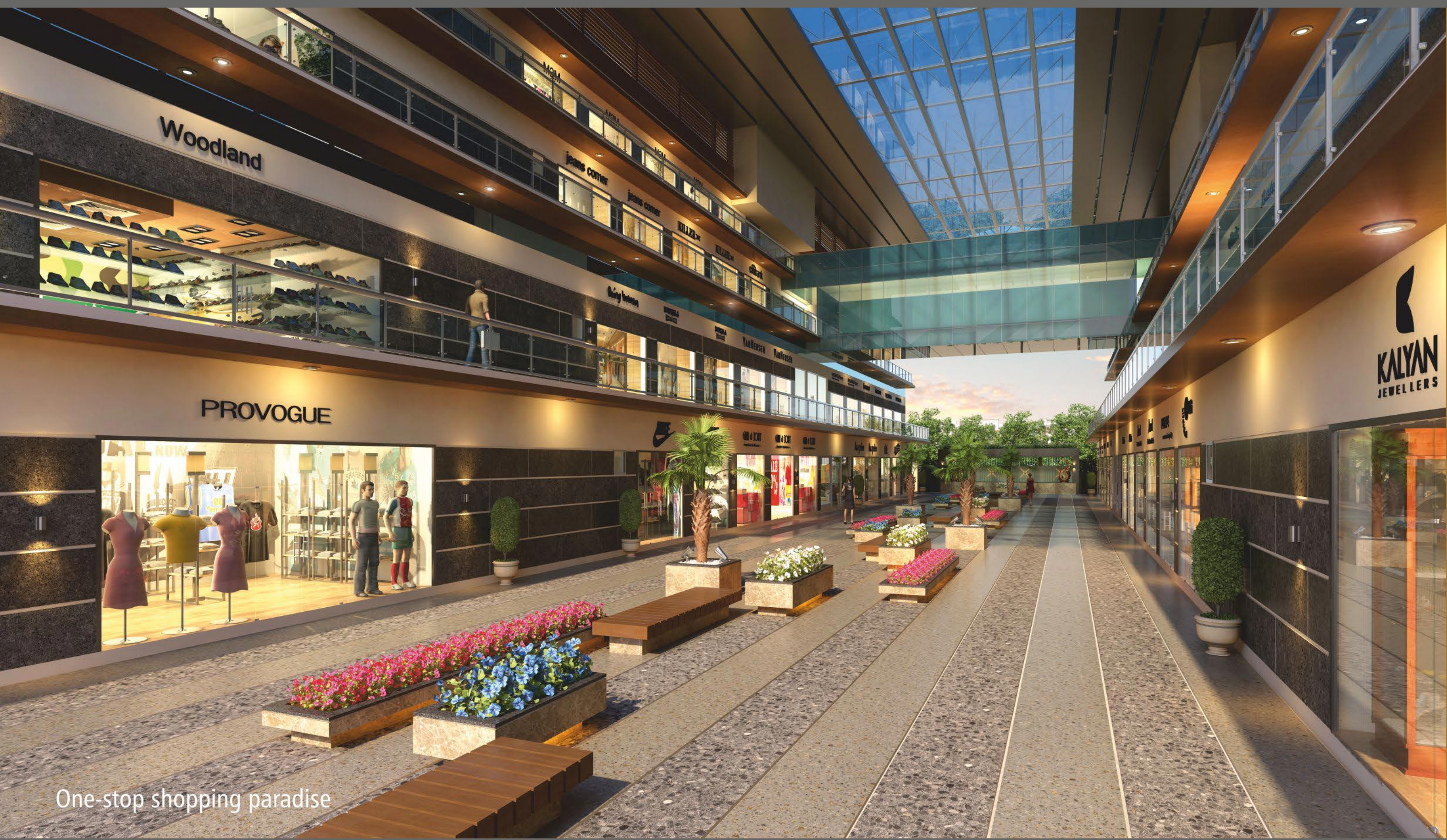
One-stop shopping paradise