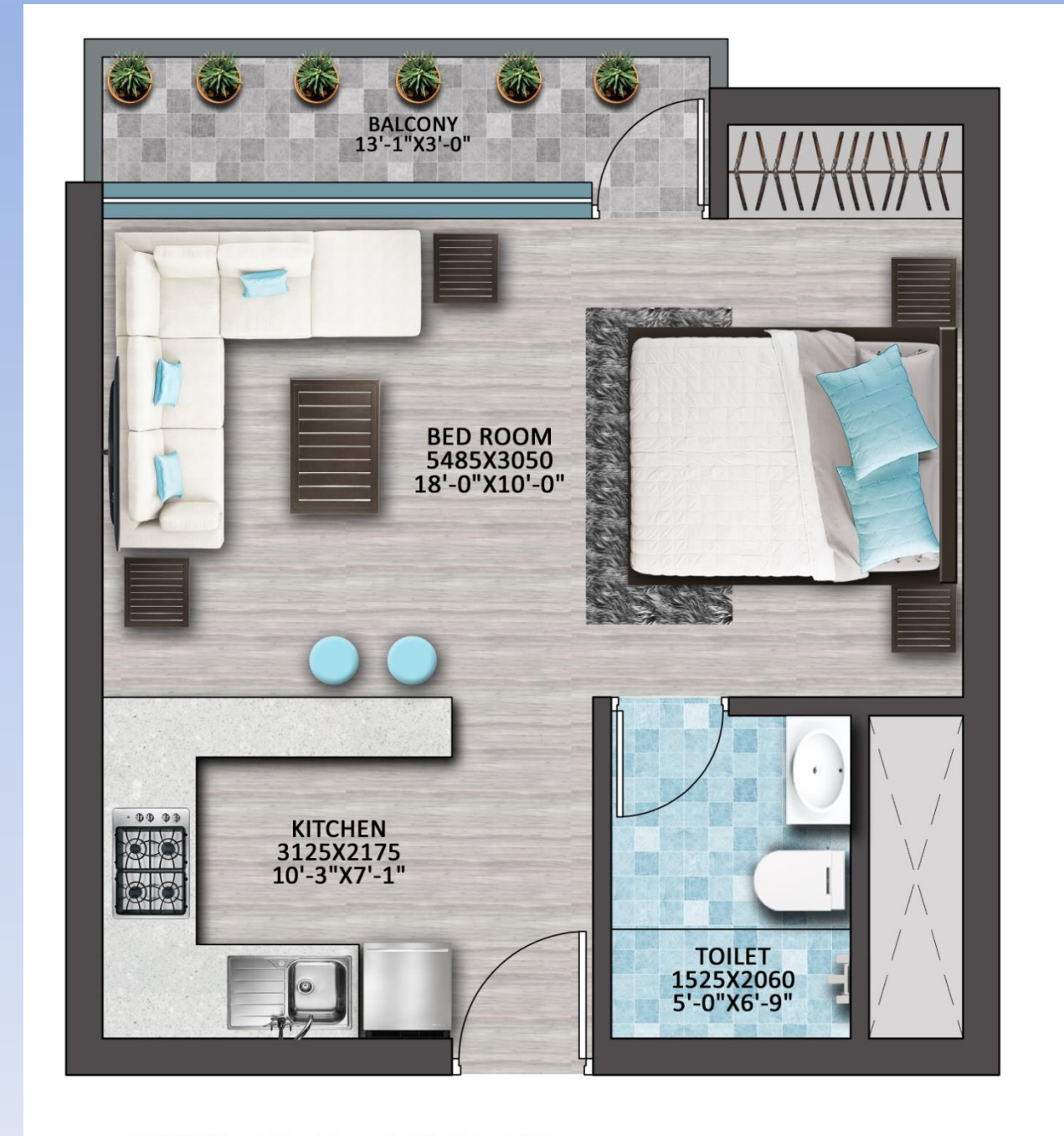
SUPER AREA= 465 SQ.FT.