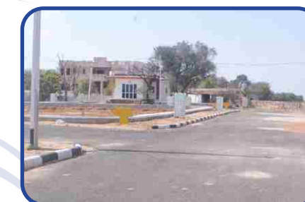
SRG GREEN CITY Maharajpura