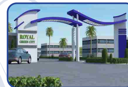
ROYAL GREEN CITY Bad Ke Balaji Ajmer Road