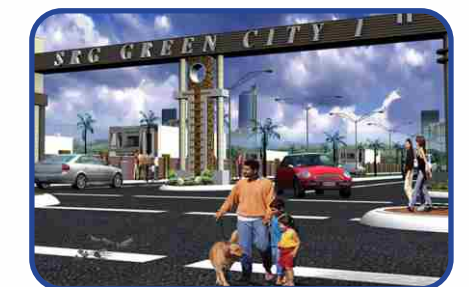
SRG GREEN CITY-I Maharajpura