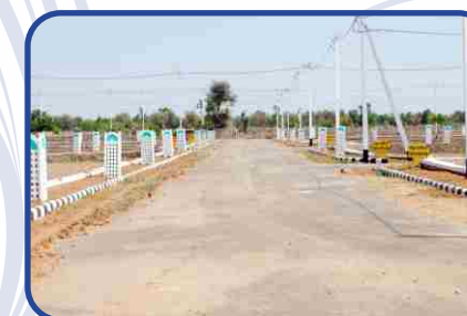
GOKUL RESIDENCY Prempura, Near SEZ