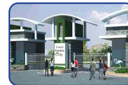
GOKUL GARDEN CITY Kishorpura, Diggi Road