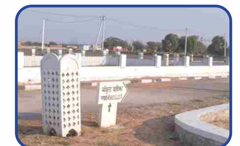
GOKUL VATIKA Muhana