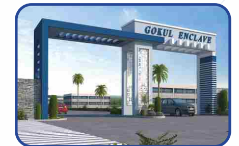
GOKUL ENCLAVE Daulatpura, Near SEZ