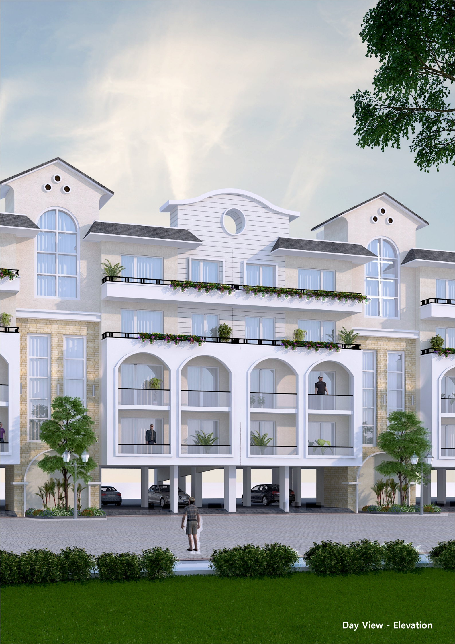
Day View - Elevation