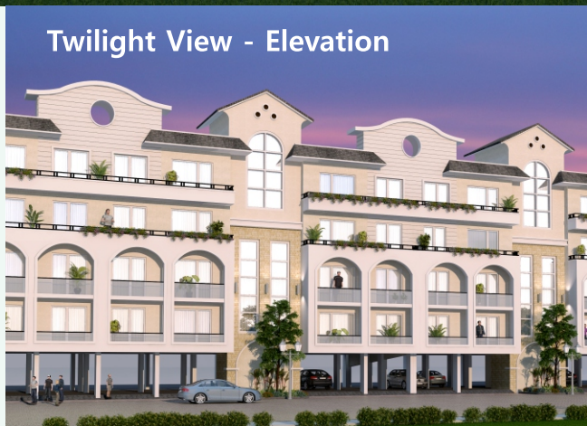
Twilight View - Elevation