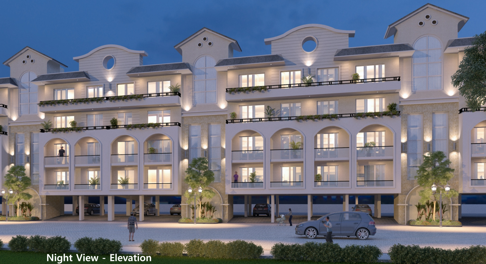
Night View - Elevation