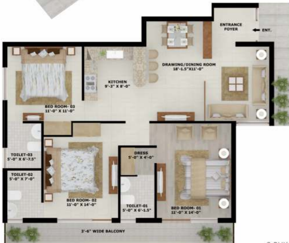
3 BHK - FLOOR PLAN