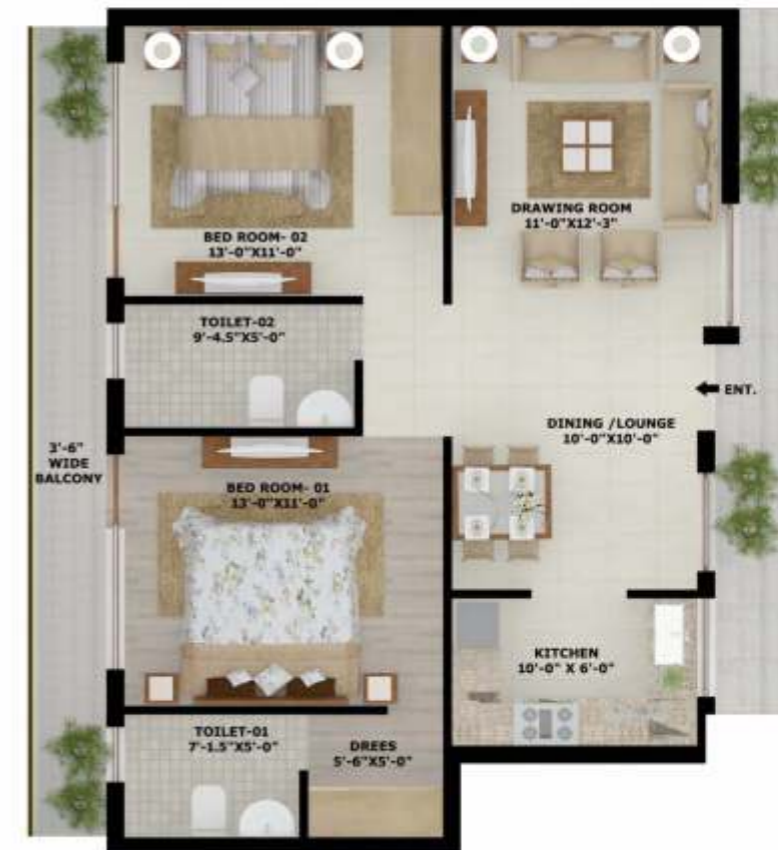
2 BHK - FLOOR PLAN