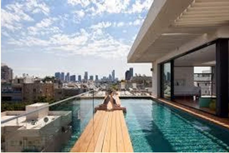
Terrace Swimming Pool at the Club House