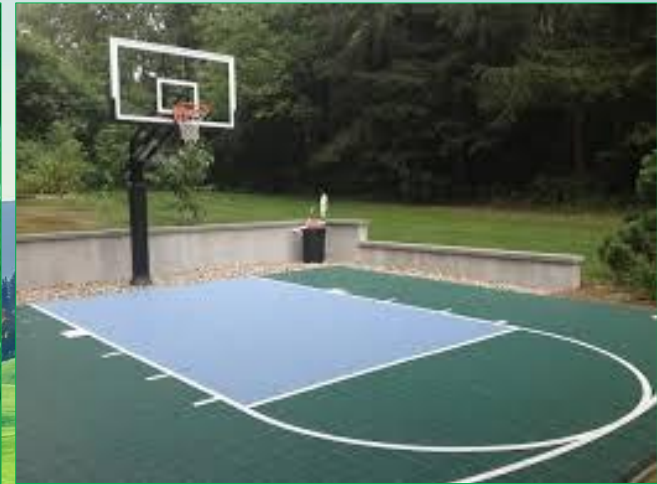
Half basketball Court