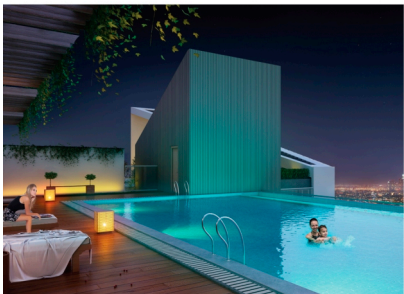
Roof Top Swimming Pool