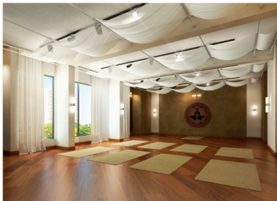
AC Yoga / Meditation Zone