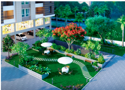
Lawn with greenery all around