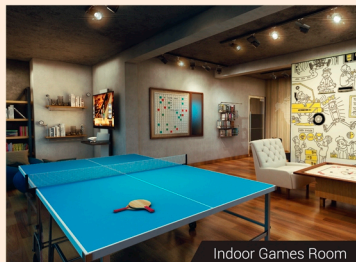
Indoor Games Room