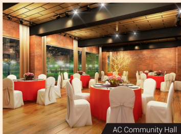
AC Community Hall