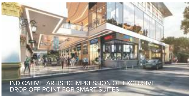
INDICATIVE ARTISTIC IMPRESSION OF EXCLUSIVE DROP-OFF POINT FOR SMART SUITES