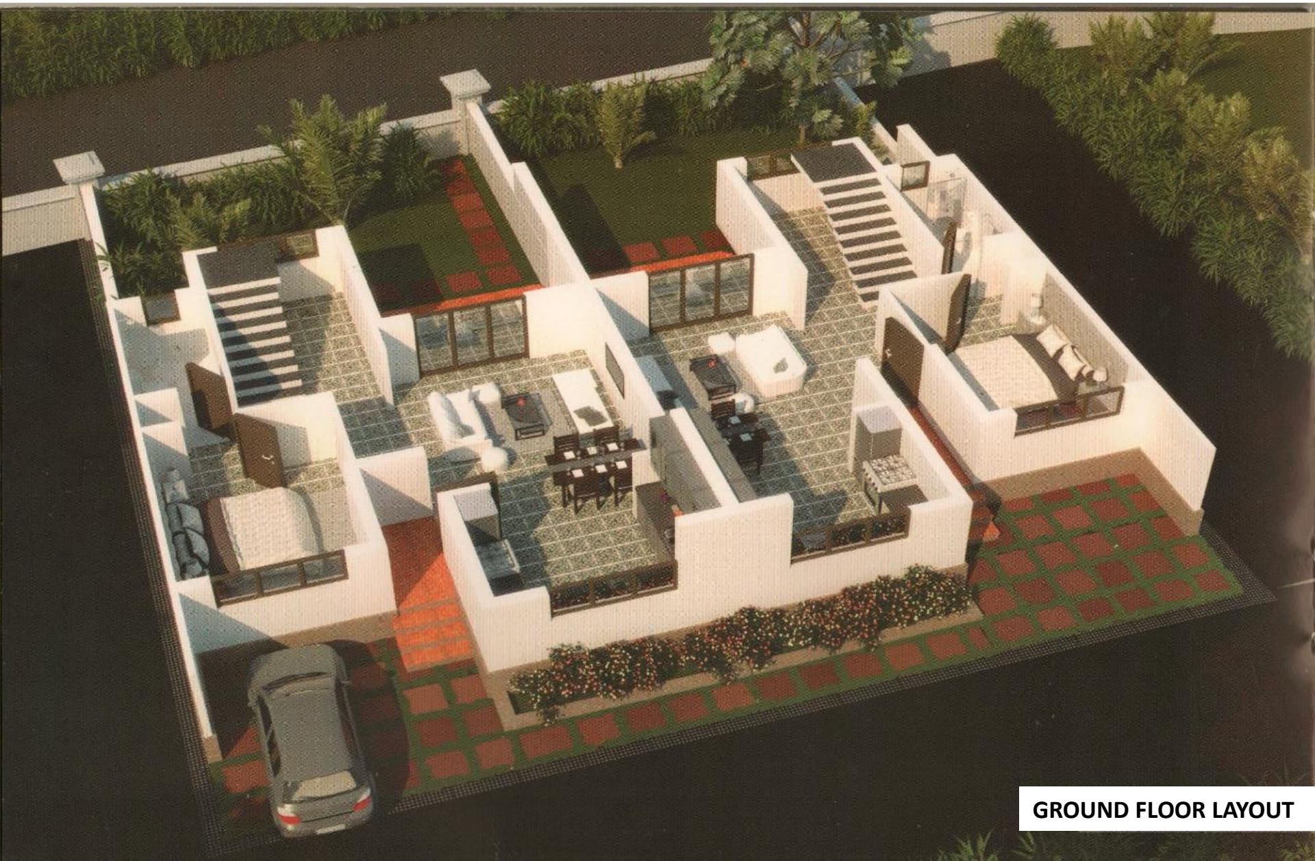
GROUND FLOOR LAYOUT