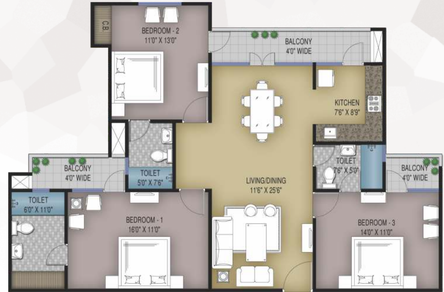
TYPE B 3BHK + 3 TOILETS