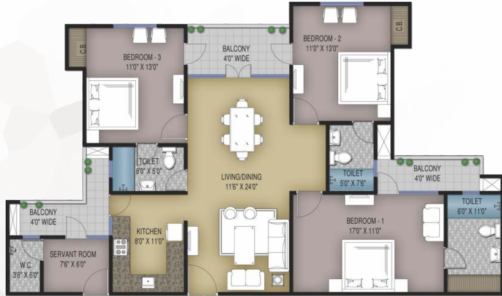
TYPE A 3BHK + 3 TOILETS WITH SERVANT ROOM