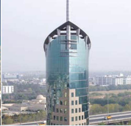
DLF Gateway Tower, Gurgaon