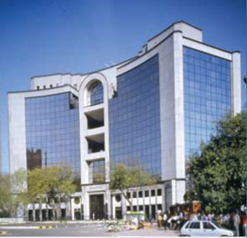
DLF Centre, Delhi