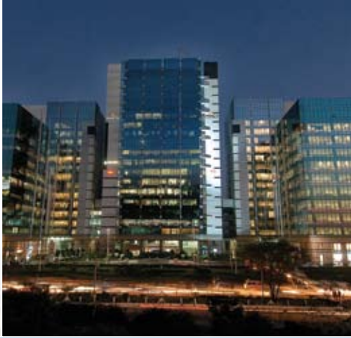
DLF Cyber Greens, Gurgaon