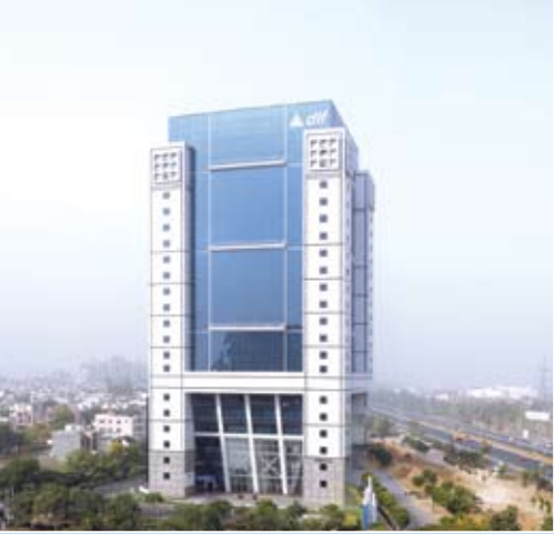
DLF Square, Gurgaon