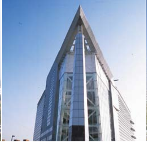
DLF Atria, Gurgaon