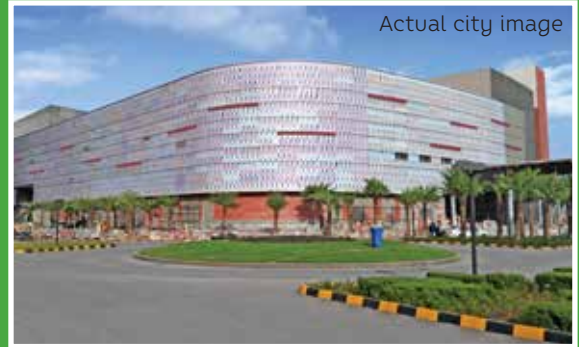
Actual city image

Palava's own city management association, PCMA makes sure that the city's residents are safe and secure, with 24x7 water and electricity supply, and 60% open spaces resulting in the cleanest air in the MMR region.