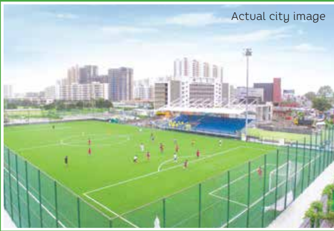
Actual city image

A little further away is the FIFA standard football stadium which offers world-class football coaching in collaboration with Arsenal Soccer Schools. The Lodha Xperia Mall with premium brands like PVR, Big Bazaar and M&S is set to launch as well.