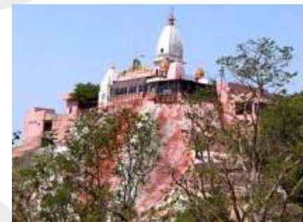
Mansa Devi Temple

Chandi Devi Temple: Legend has it that Chanda-Munda, the army chief of the local demon king, Shumbha-Nishumbha, was killed by Goddess Chandi here after which the place got the name Chandi Devi. This temple, situated on top of the Neel Parvat on the other bank of river Ganges was constructed in AD 1929 by Suchat Singh, the then King of Kashmir. The temple is a 3-km trek from Chandi Ghat and it is believed that the Adi Shankaracharya established the main statue in eighth century AD. The Chandi Devi Temple is now also accessible by a ropeway, which starts near the Gauri Shankar Temple.