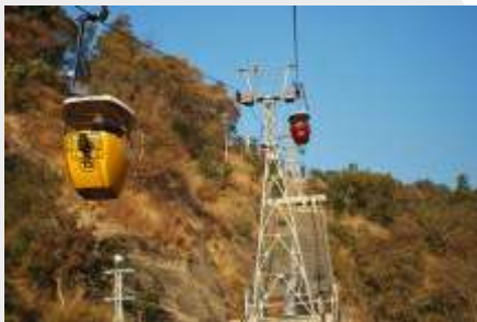
Chandi Devi Temple

Vaishno Devi Temple: This temple is a newly constructed and a true replica of the original Vaishno Devi temple in Jammu & Kashmir.