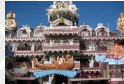
Vaishno Devi Temple

Har-ki-Pauri: It is one of the most popular ghats in Haridwar. This sacred ghat was constructed by King Vikramaditya in the memory of his brother Bhartrihari. It is believed that Bhartrihari eventually came to Haridwar to meditate by the banks of the holy Ganga. When he died, his brother constructed the Ghat in his name which later came to be known as Har ki Pauri. This sacred bathing Ghat is also known as Brahmakund. The golden reflection of floral diyas in the river Ganges is the most enchanting sight in the twilight during the Ganga aarti ceremony at the ghat.