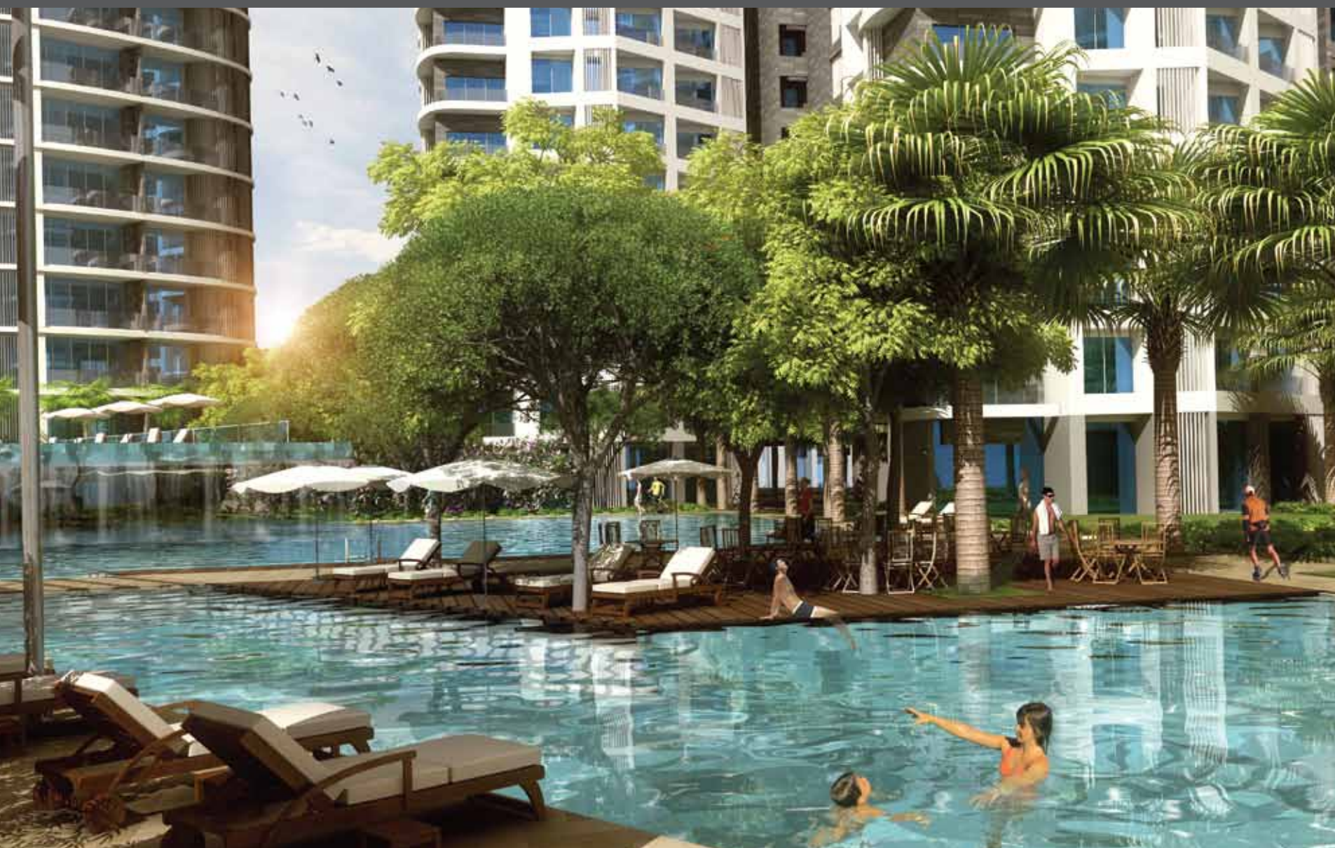
60,000 sq.ft. of breathtaking landscape