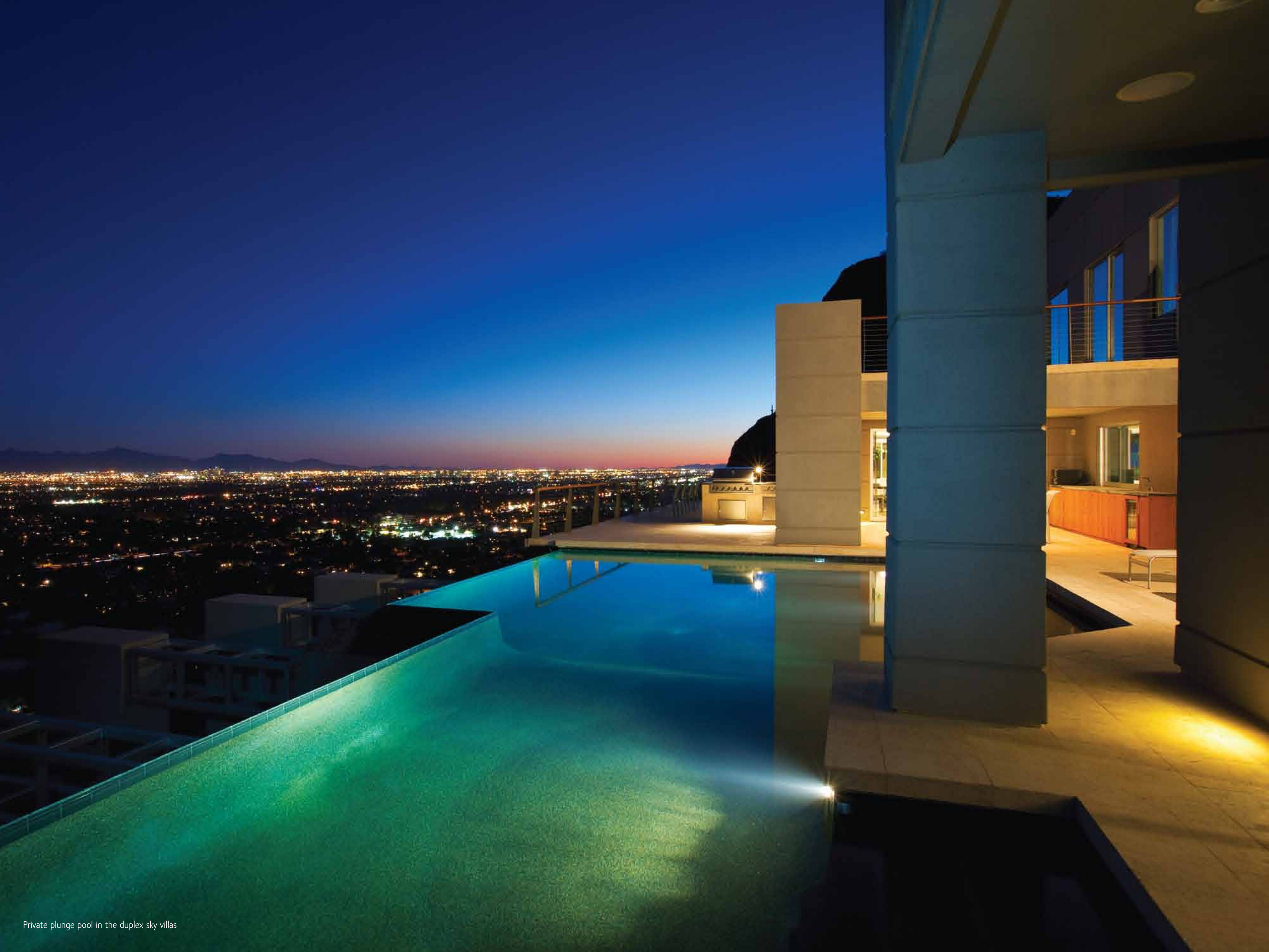
Private plunge pool in the duplex sky villas