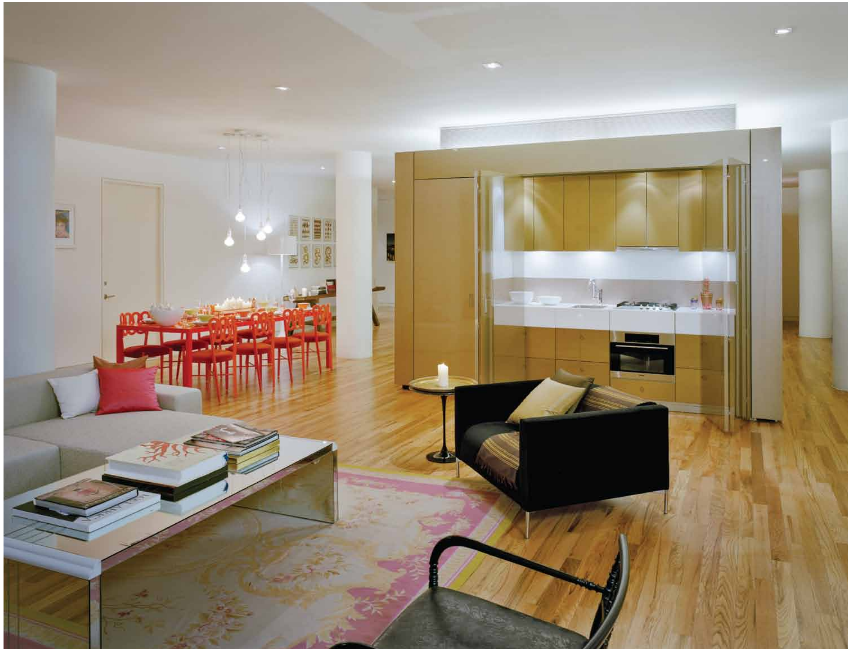
The Jade, an urban-chic luxury condominium project in New York City. Jade Jagger introduced the concept of pods – brilliantly designed, free-standing kitchens, bathrooms and storage units that could either be hidden behind a lacquered screen, or left open to access the facilities within.