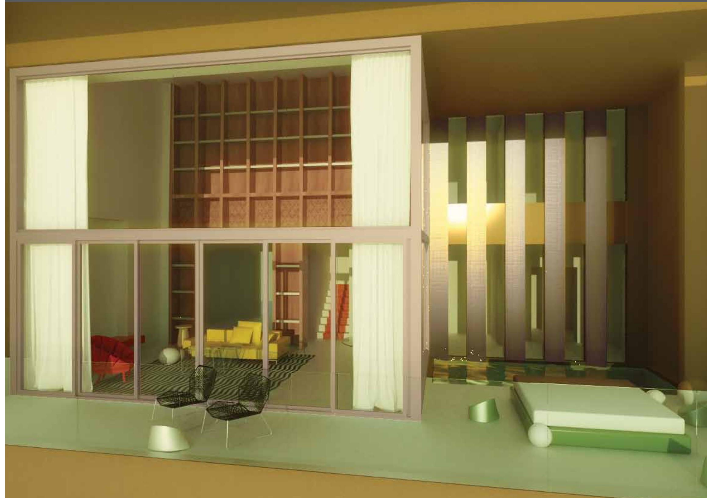
Luxo theme-based design for living room with plunge pool at Lodha Fiorenza

Imbued with thoughtful planning and design, Luxo by Jade Jagger for yoo stands for true luxury living – sumptuous and rich, yet with a quiet sophistication all its own.