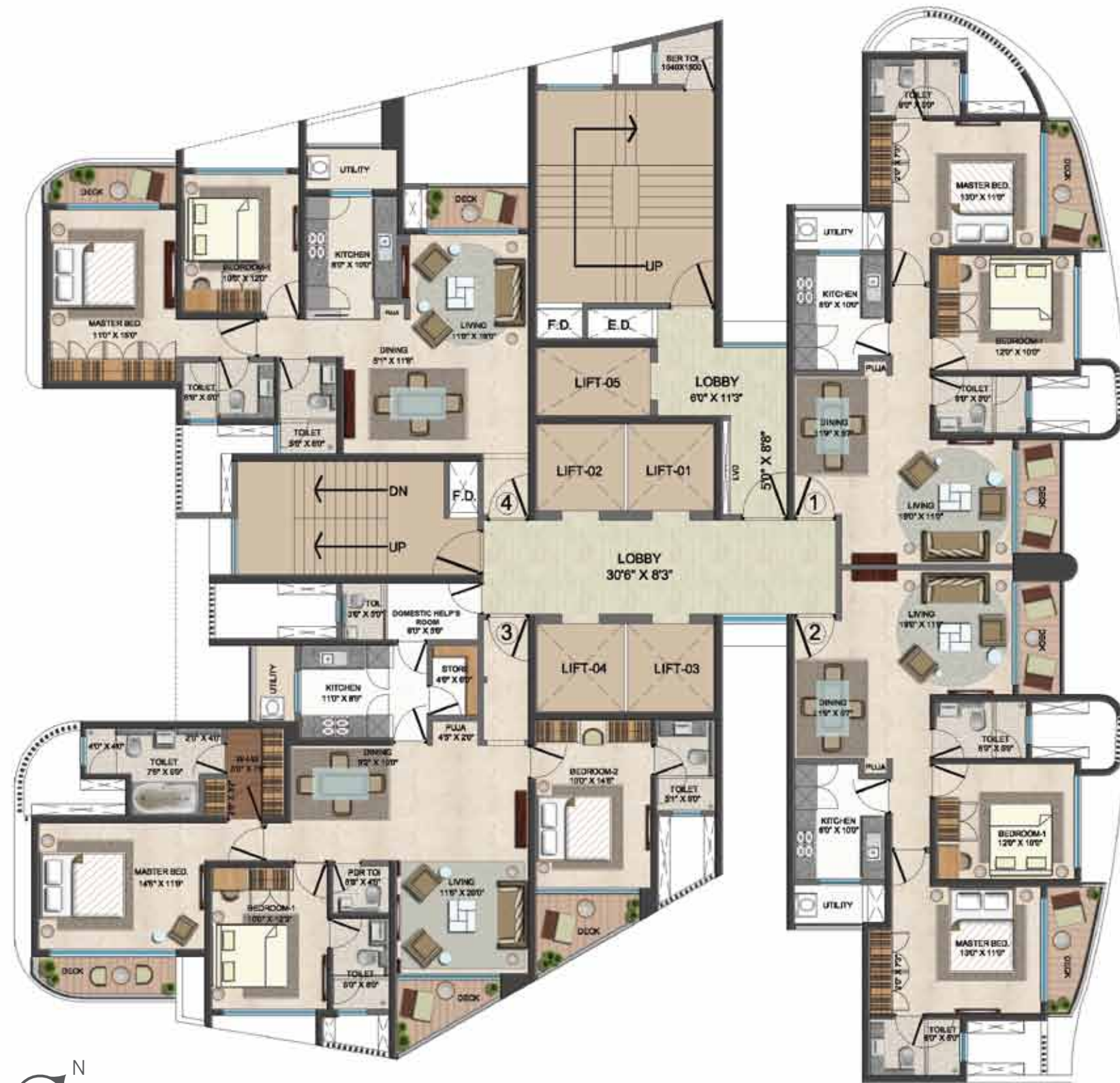
Venizia floor plan