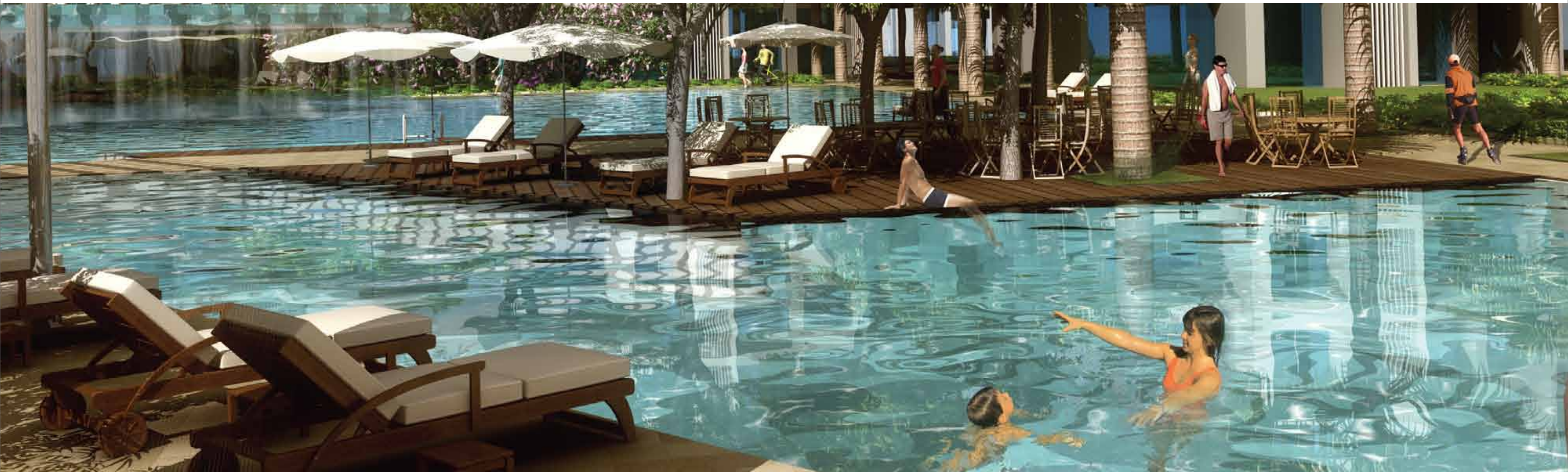
The poolside at Club Fiorenza