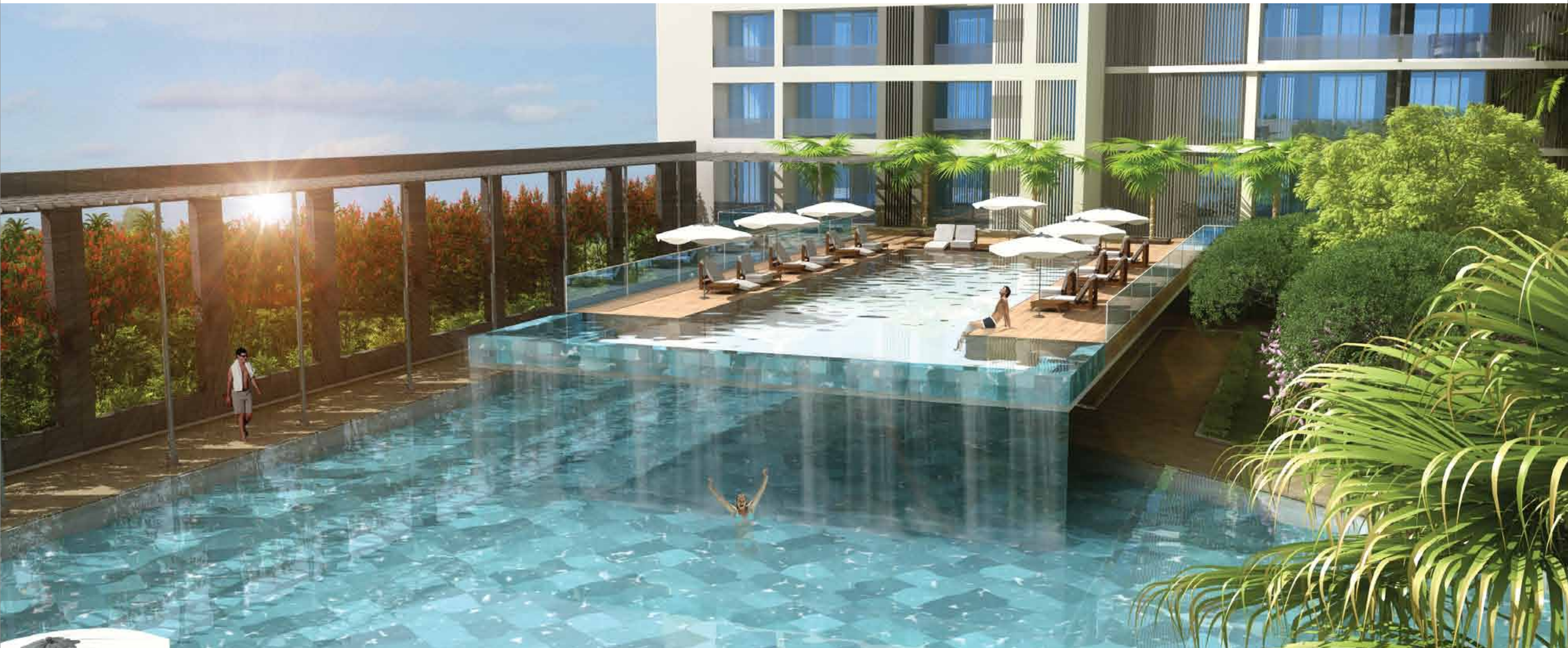
Infinity-edge cantilevered pool at Club Milano