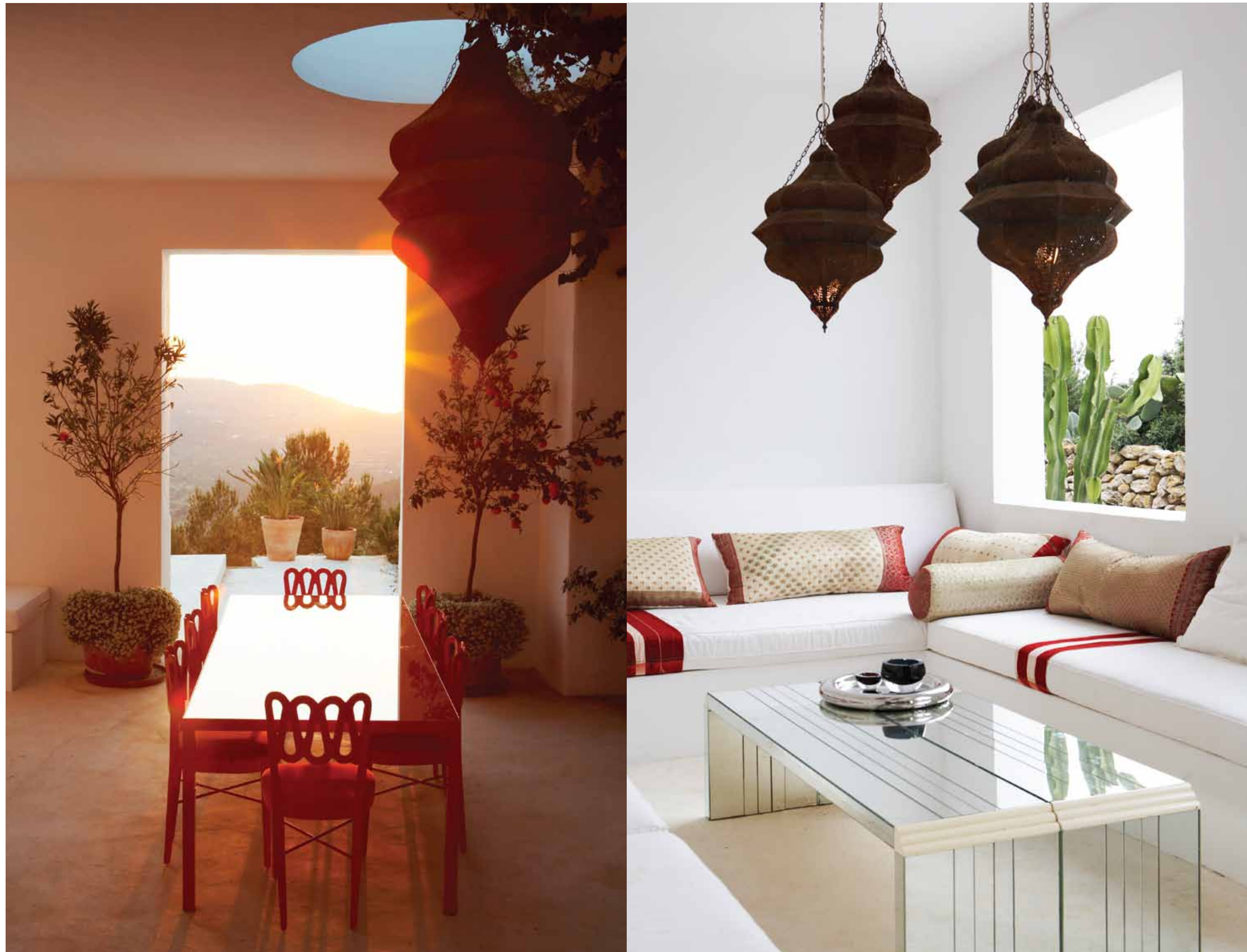
For this exclusive private villa in Ibiza, Spain, Jade Jagger for yoo has combined intricate Moroccan motifs with contemporary European designs, to create a unique architectural masterpiece.