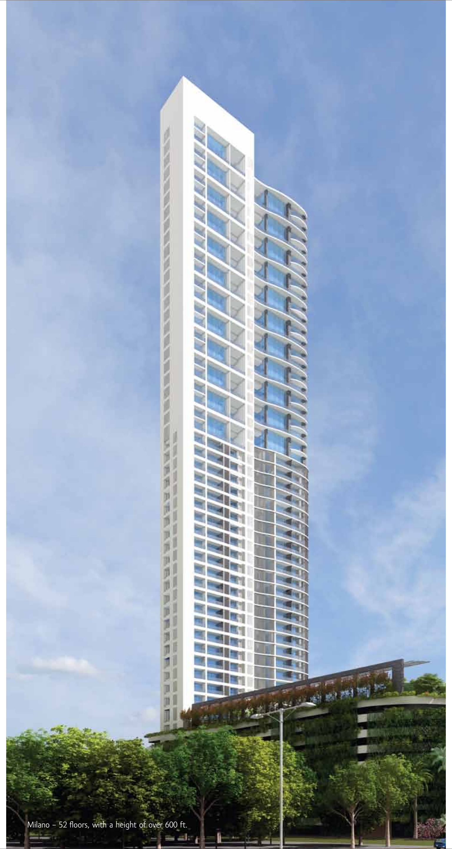
Milano – 52 floors, with a height of over 600 ft.