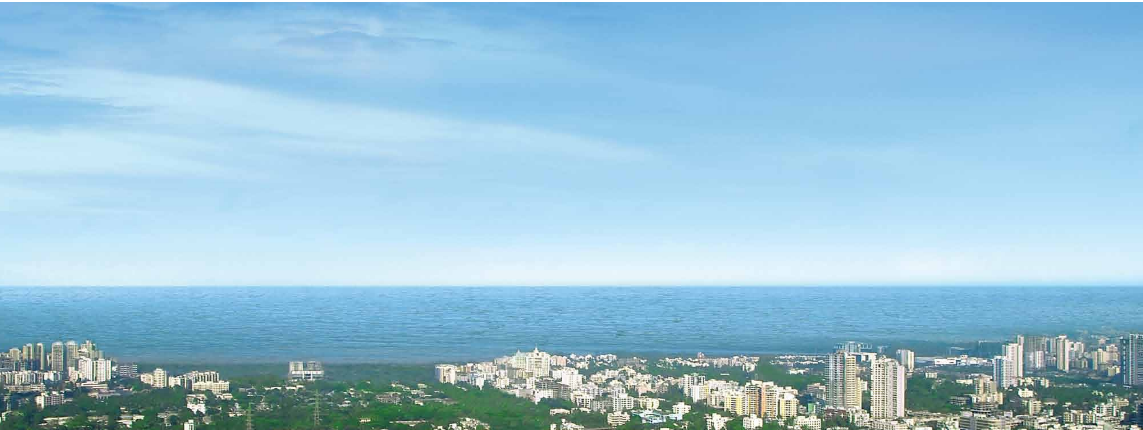
Spectacular views of the Arabian Sea