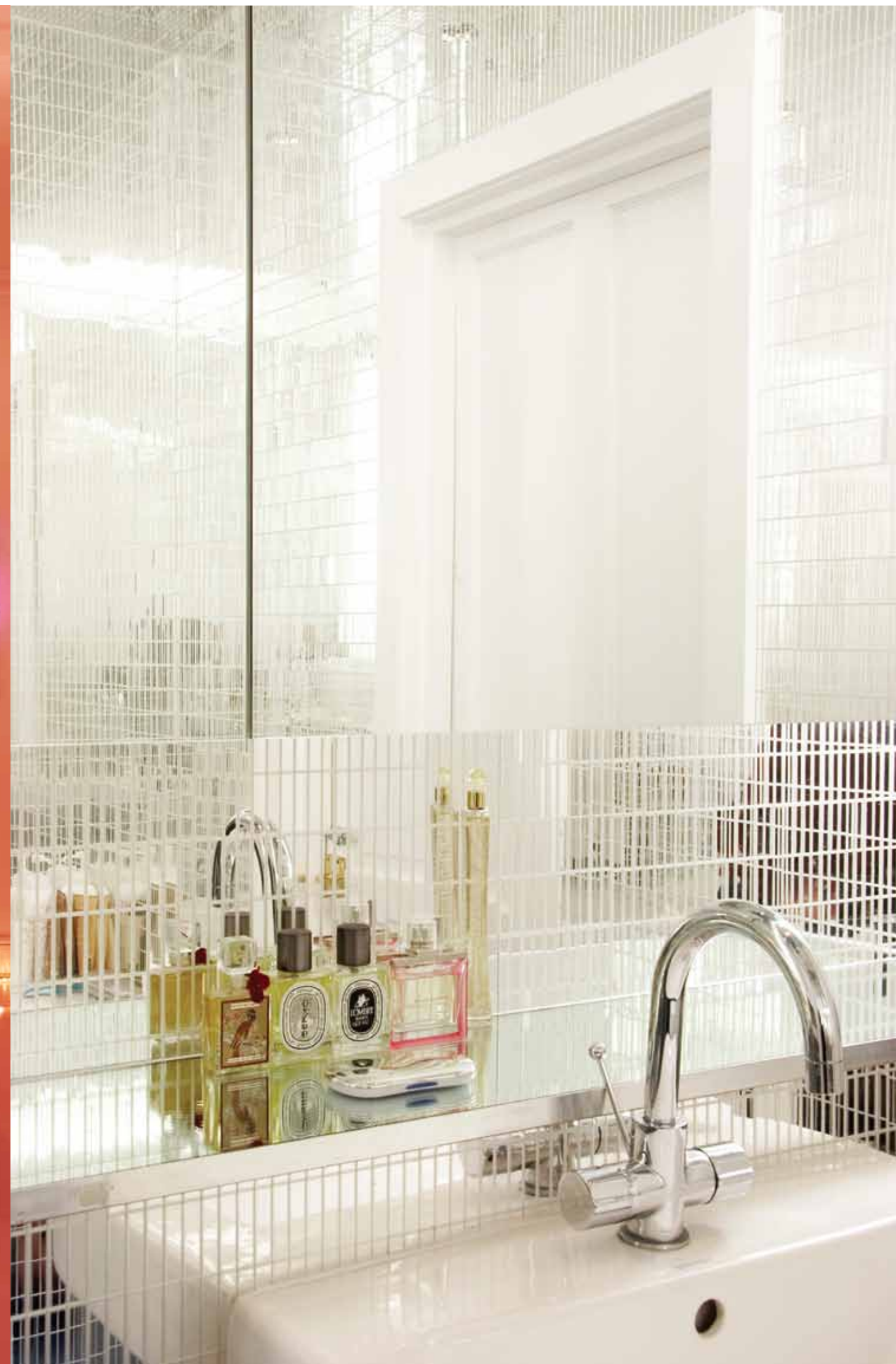
Interiors designed by Jade Jagger for yoo.