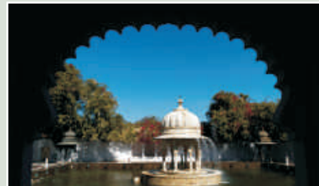
Saheliyo Ki Badi