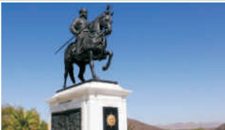
Moti Magri - Pratap Memorial