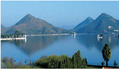
Fateh Sagar Lake