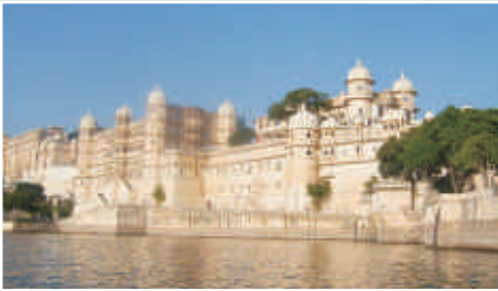
The City Palace