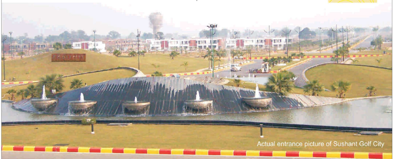
Actual entrance picture of Sushant Golf City